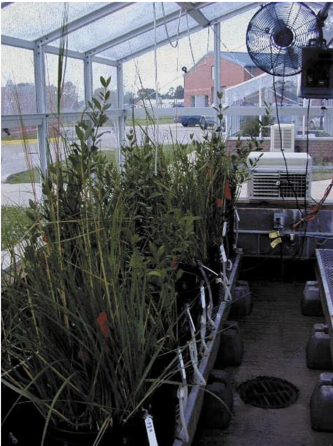
Figure 4. An experiment to determine effects of elevated carbon dioxide (CO 2 ) and other factors on a mangrove-salt marsh community.

Carbon dioxide concentration in the atmosphere has increased about 21 percent from 280 parts per million (ppm) in preindustrial times to approximately 370 ppm today and is predicted by some models to double within the next century. Effects of elevated CO 2 and climate change will likely be apparent first in geographic areas where major vegetation types meet. With funding from the USGS Global Change Program, investigators are conducting experiments to determine the relative responses of this mangrove-salt marsh community to CO 2 enrichment and interactions with local factors such as nutrient regime (fig. 4). Preliminary results indicate that vegetation shifts from salt marsh to mangrove-dominated communities will not occur by increases in CO 2 alone, especially where soil conditions promote growth of smooth cordgrass which suppresses expansion of black mangrove; however, where smooth cordgrass is stressed or eliminated, for example by climate extremes, black mangrove may invade salt marsh (fig. 2).