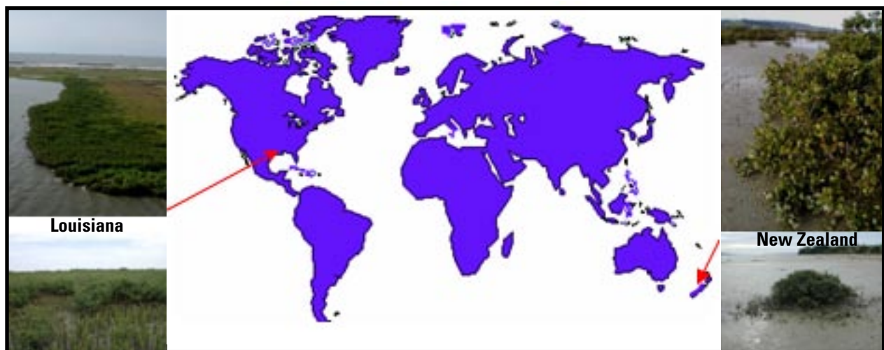
Figure 3. U.S. Geological Survey scientists are studying mangrove populations at the latitudinal extremes of distribution near Port Fourchon, Louisiana, USA, and at Waikopua Creek, New Zealand.