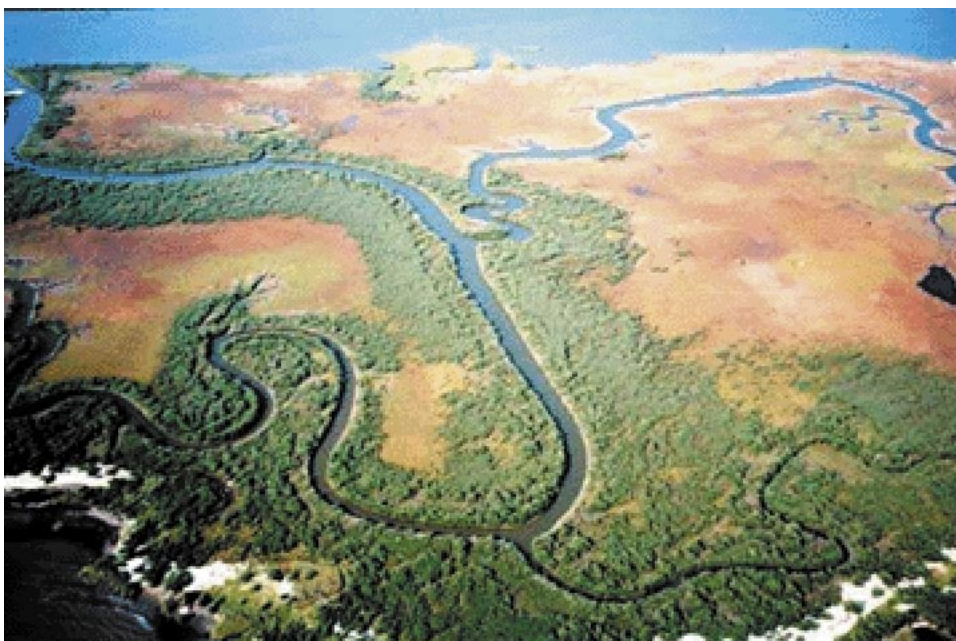
Figure 1. Black mangrove-salt marsh community in coastal Louisiana. Brown areas are dead marsh, and green vegetation is healthy black mangrove.

Mangroves in the continental United States reach the northern limits of their range in southern Florida, Texas, and Louisiana where they intergrade with the temperate salt marsh grass, Spartina alterniflora (smooth cordgrass). Scientists at USGS are focusing on the ecotone between salt marsh and black mangrove ( Avicennia germinans ) in coastal Louisiana (fig. 1). Numerous populations of black mangrove occur in scattered stands across the deltaic plain (29° N latitude), typically dominating creekbanks where they have become established. In Louisiana, black mangrove is periodically damaged or killed by