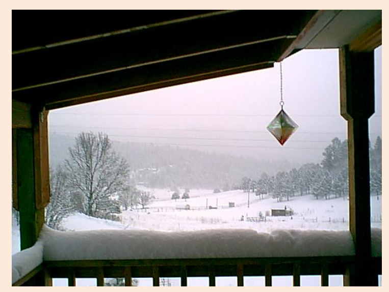
Just east of Cloudcroft on January 22.

February 1-2: Heavy snows fall across the southern Sacramento Mountains with 12 inches reported around Mescalero. Over southwestern New Mexico in Grant County, 6 inches of snow fall at Mimbres and 1 to 3 inches are reported around Silver City. Elsewhere in Grant County, thunderstorms with small hail move across the Hurley area.