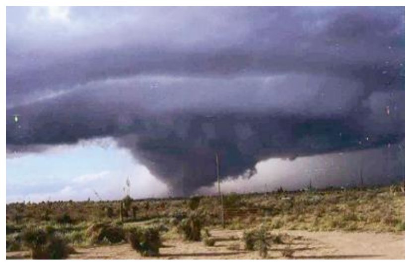
On October 9 this large tornado develops in the desert near Deming NM.

By the middle of February however, the weather pattern becomes more favorable for westerly winds and high pressure. Thus warmer drier weather prevails through late winter and early spring.