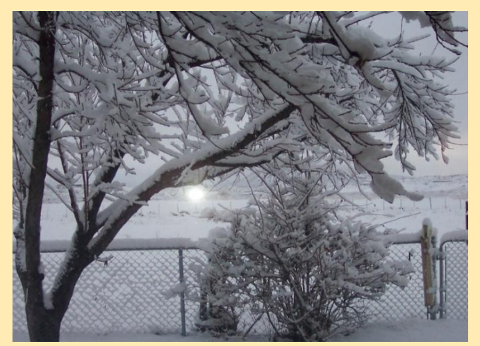
On January 22, 7 inches of snow fall at Buckhorn.

Jan 26: Snow again falls over the Borderland with 1 to 3 inches reported over most locations of southern New Mexico and western Texas.