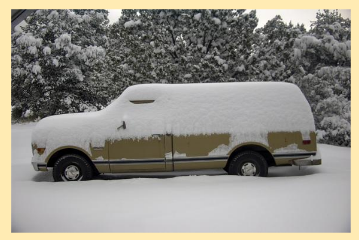
Silver City experiences heavy snow on January 22.