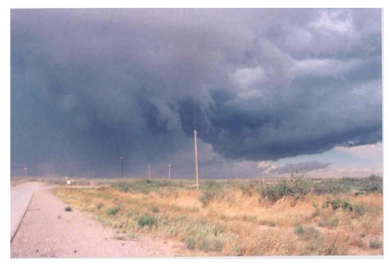
Thunderstorms produce this small tornado over White Sands Missile Range on October 15.

Nov. 29-30: Across the southern Sacramento Mountains, late autumn storm drops 6 inches of snow over Mescalero with 5 inches of snow around Cloudcroft.