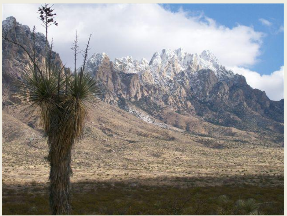
Snow-covered Organ Mountains near Las Cruces.