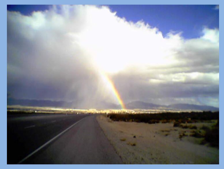
Rainbow near showers over southern Dona Ana County on January 12.

Jan 19: A deep upper-level low pressure system brings a variety of winter weather to the Borderland. In southwestern New Mexico, 9 inches of snow fall at White Signal with 6 inches of snow at Mimbres and 5 inches at Hillsboro. Across the El Paso, Deming, and Lordsburg vicinities snow, sleet and ice pellets fall creating major traffic problems, especially over Interstate 10. A mixture of freezing rain, sleet and snow occur in the Ft. Hancock area of Hudspeth County. Cloudcroft again experiences heavy snow with 6 inches accumulating around the area.