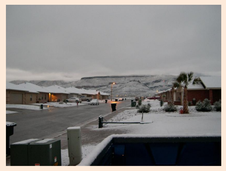
On January 26, several inches of snow fall around the Alamogordo area.

March 11: Thunderstorm winds gust to 60 mph at Caballo and Hurley NM.