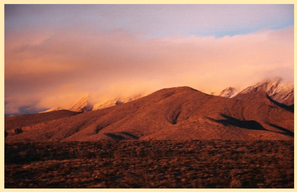
Western slopes of the Franklin Mountains near sunset.

Jan 22: Another low pressure system dumps heavy snow over much of the area. Around Silver City, 8 to 13 inches of snow fall while Cloudcroft again gets hit hard with another 8 to 12 inches. Elsewhere, 10 inches of snow are reported at Kingston, 7 inches at Buckhorn and 6 inches at Animas.