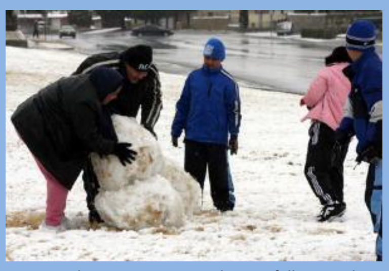
Fun in the snow in west El Paso following the January 19 storm.