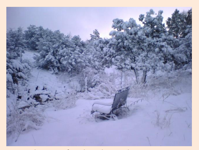
Pinos Altos NM after the February heavy snows.

Mar: 25 Severe thunderstorms produce penny-sized hail near Sierra Blanca TX.