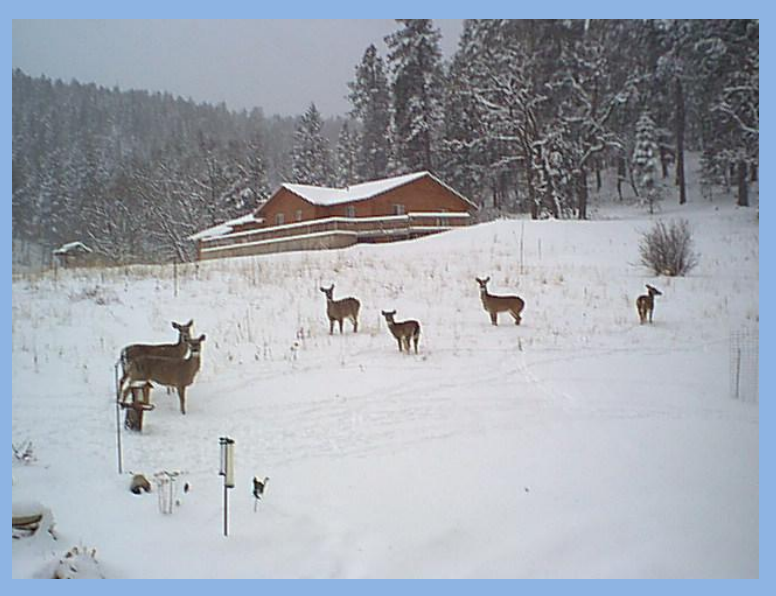
Near Cloudcroft after the heavy snows of January 19.