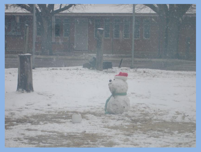
Clint TX after the January 2 snowfalls.