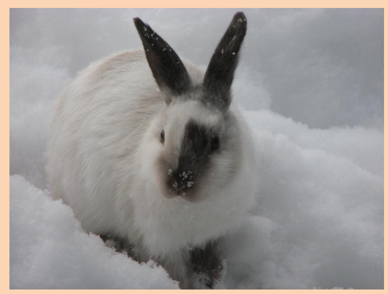
Rabbit wanders about in the snows near Capitan NM.

December 31: Morning dense fog lowers visibilities under a quarter mile in the El Paso metropolitan area.