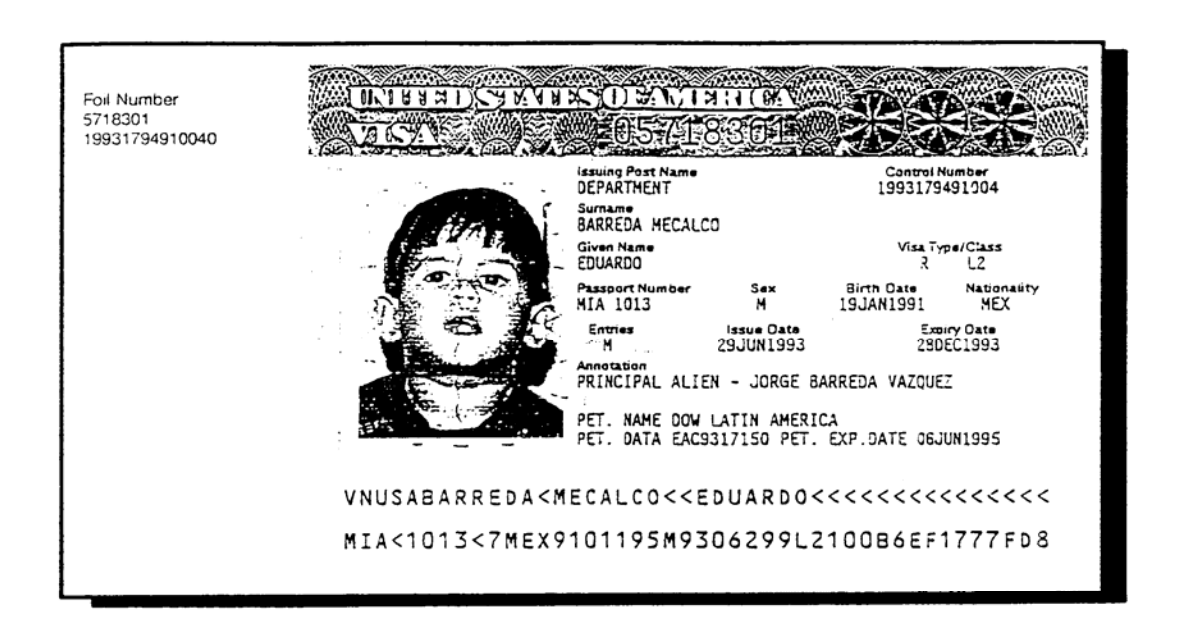
EXHIBIT III EXAMPLES OF MACHINE-READABLE VISA (MRV)