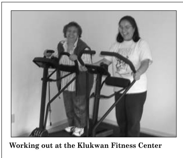
Working out at the Klukwan Fitness Center

At the end of the 3-month competition, SEARHC staff host a dinner celebration to honor the women who complete and turn in their calendars. Each woman receives a wrapped gift such as a sandwich cooler bag or water bottle. Many women attending the dinner say the competition has had a positive effect on their health. Some women say they feel better, whereas others talk about losing inches around their waist. One woman lowered her cholesterol level by 30 points. Other women have been motivated by these successes.