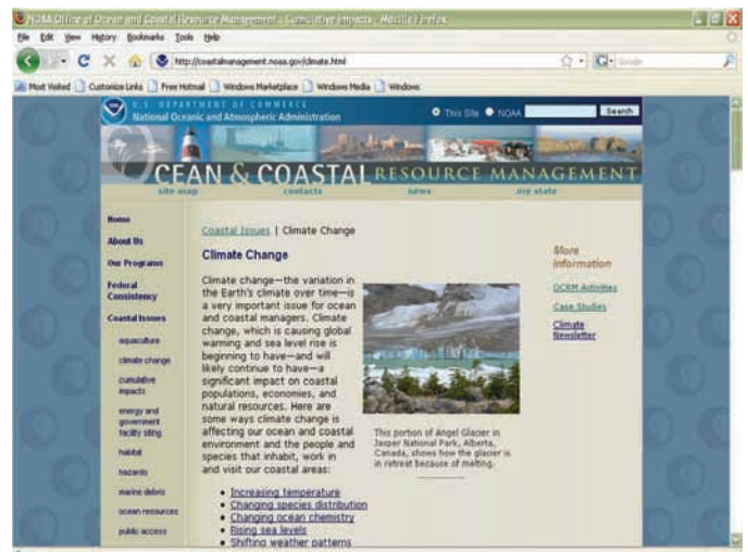
OCRM's climate change web page informs the public about the impacts of climate change on coastal habitats and communities and highlights what OCRM and its partners are doing to respond to climate change.

NOAA's Office of Ocean and Coastal Resource Management (OCRM) has launched a new section of its web site focusing on climate change ( http://coastalmanagement.noaa.gov/climate.html ). Designed as a resource for coastal managers, as well as to inform the public about the effects of climate change on coastal habitats and communities, the site includes discussion of such climate change impacts as sea level rise, ocean acidification, and changing species distribution. A section on OCRM activities explains some ways OCRM is helping coastal managers address climate change. Another section features case studies of how OCRM state coastal management partners are working to prepare for climate change and respond to its impacts. Visitors will also find links to other climate change information sites as well as archived issues of the Coastal Program Division's CZMA Climate Change and Coastal Hazards E-News Update .