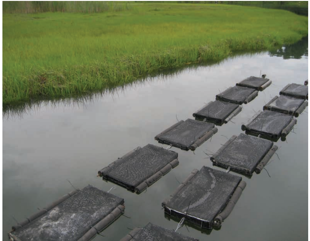
Floating bags, used to grow oysters, are one example of the emerging aquaculture technologies being used in Connecticut.

These emerging practices have created concerns over boater safety, navigation, and potential environmental and aesthetic impacts. In Connecticut, four DEP programs, the DA/BA, the USACE, and the local shellfish commissions all play a role in aquaculture permitting to ensure these diverse concerns are addressed. With so many entities involved, the aquaculture permitting process has been very complex and cumbersome for both aquaculturists and regulatory agencies.