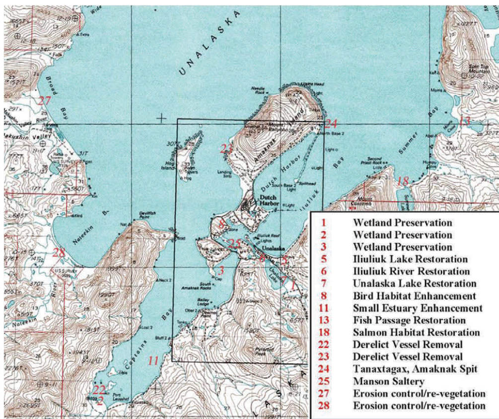
The mitigation guide identifies and evaluates potential mitigation opportunities for the Unalaska region .

The AWCRSA officially incorporated the updated guide, Mitigation Opportunities in Unalaska , into its approved local coastal program. Potential mitigation projects identified in the guide include derelict vessel removal, wetland preservation, habitat enhancements, and archeological site preservation. The guide describes each project’s objectives and overall goal, the project’s location, and any potential implementation issues. It also includes pictures of the site areas.