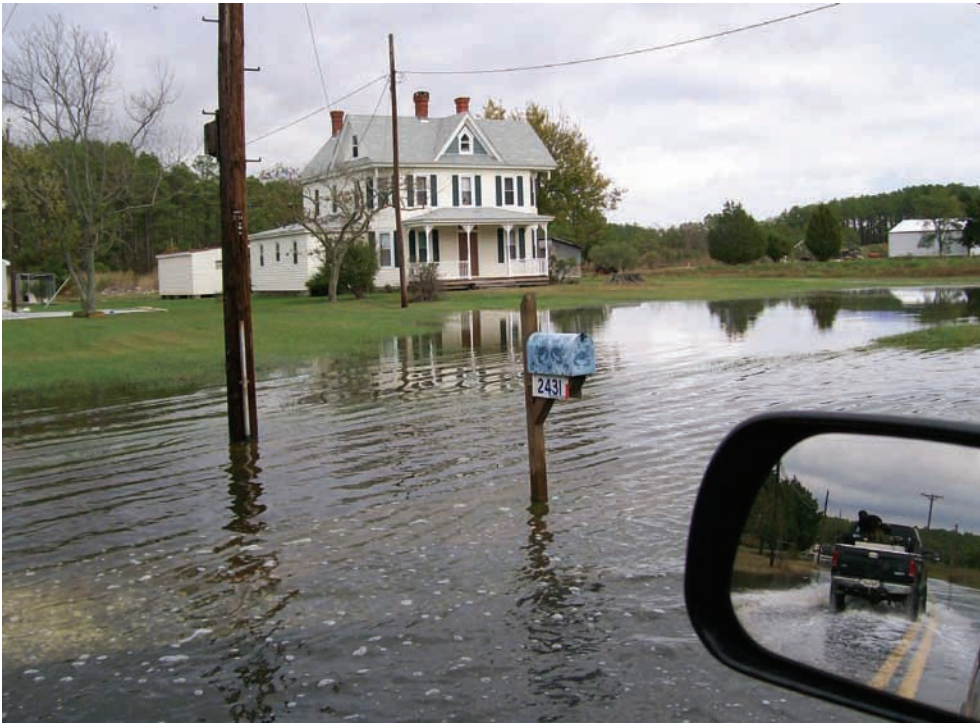
Dorchester County, Maryland, during a high tide in 2007. As sea levels rise, extreme high tide events are becoming more frequent.