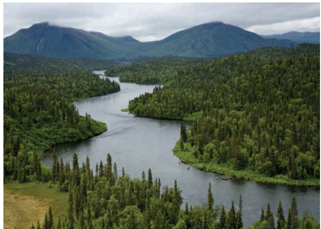
Portions of the Agulowak River in Alaska were recently protected with funding from the Coastal and Estuarine Land Conservation Program.

The FY2010 Coastal and Estuarine Land Conservation Program (CELCP) competition closed March 31, 2009. In total, NOAA received 53 proposals from 26 states and territories, totaling approximately $88 million. Merit reviewers will begin their process soon. Reviewers include representatives from the coastal zone management and estuarine reserve community, NOAA coastal and habitat-related programs, other federal land conservation programs, and nongovernmental organizations. NOAA expects to finalize its ranked list of "ready and eligible" projects by September 2009.