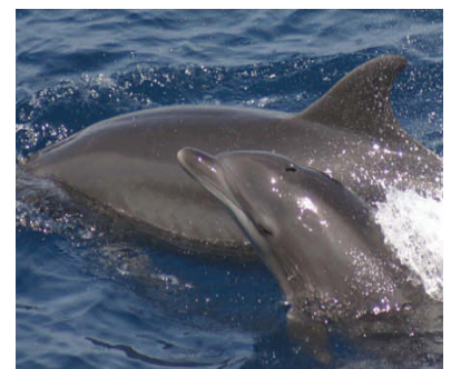
Learn about the Dolphin SMART program. See Page 2.

Page 7: NATIONAL SEA GRANT LAW CENTER: AN UNTAPPED LEGAL RESOURCE