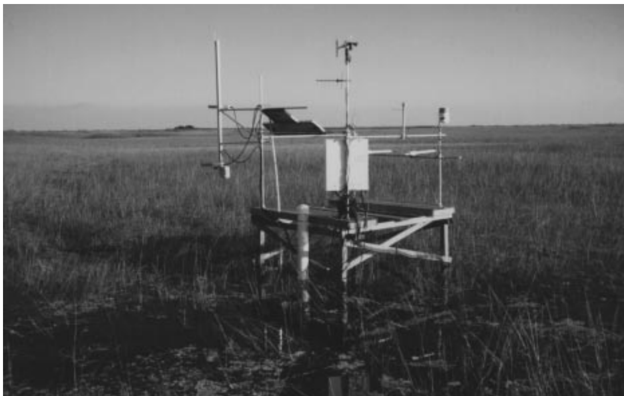
Figure 3. Evapotranspiration (ET) site 7.