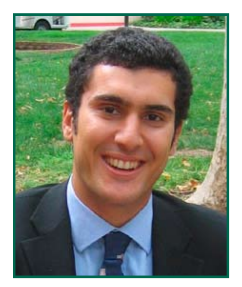
Ph.D., Chemical Engineering, California Institute of Technology (Caltech), 2008 CIRA Postdoctoral Fellow in Boulder, CO