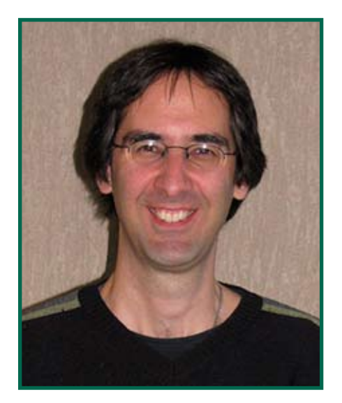
Ph.D., Princeton University, Atmospheric and Oceanic Science, 2001 CIRA Postdoctoral Fellow in Fort Collins, CO