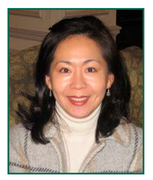
Ph.D., Atmospheric Sciences, Univ. of Washington, Seattle, 2004 CIRA Postdoctoral Fellow in Camp Springs, MD