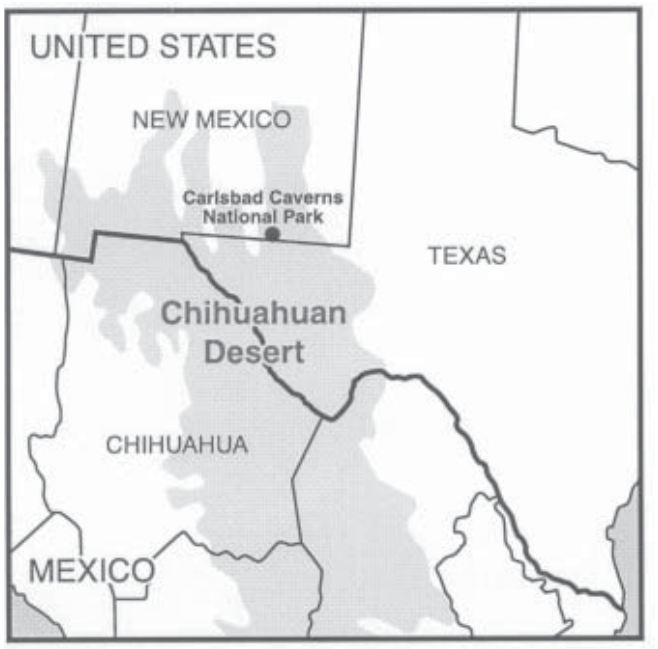
Figure 1. Northern Chihuahuan Desert and location of Carlsbad Caverns.

Texas state line (Figure 1). The desert reaches its northeastern limit in southeastern New Mexico and is replaced by the Great Plains to the east and Rocky Mountain region to the north.