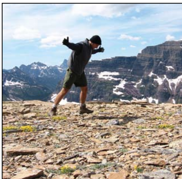
Feeling the wind at Dawson Pass