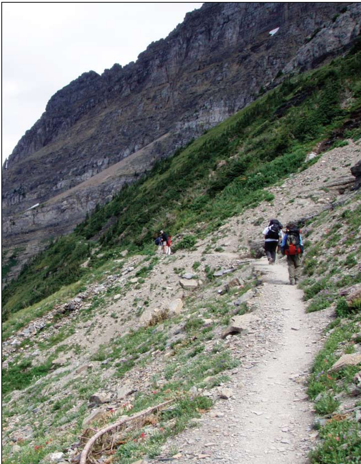
Hiking the Highline Trail