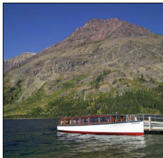
Two Medicine Lake and the Sinopah