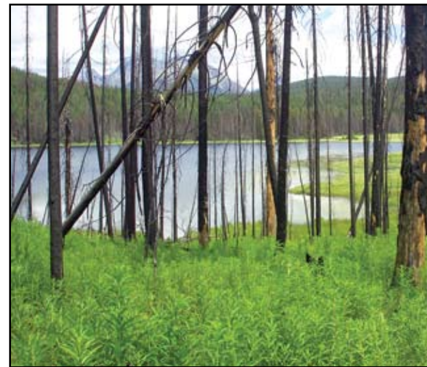
New growth following a fire

Meet in the Lake McDonald Lodge Auditorium for these evening slide programs on the many wonders of Glacier National Park. These programs are free and everyone is welcome. 45 minutes