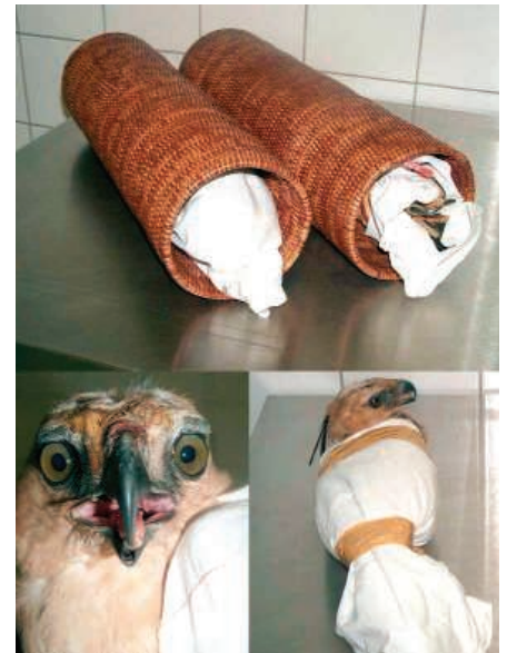
Stowaways. These crested hawk eagles, infected with H5N1, were smuggled from Bangkok to Brussels in an air traveler's carry-on bag.

The die-off immediately raised alarms that surviving birds might carry the virus to