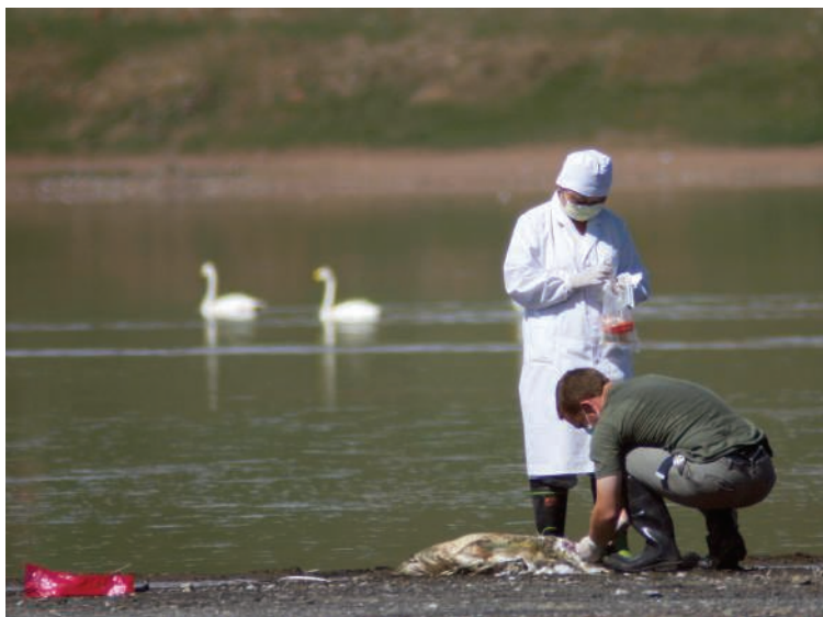
Heads up. Researchers worry that bar-headed geese might carry the H5N1 virus from the sites of outbreaks in northern China and Mongolia to India and Bangladesh.

Waterfowl have been shown to carry low-pathogenicity viruses of virtually all possible combinations of H and N, including low-pathogenicity versions of H5N1. So far, however, there is no known natural reservoir for