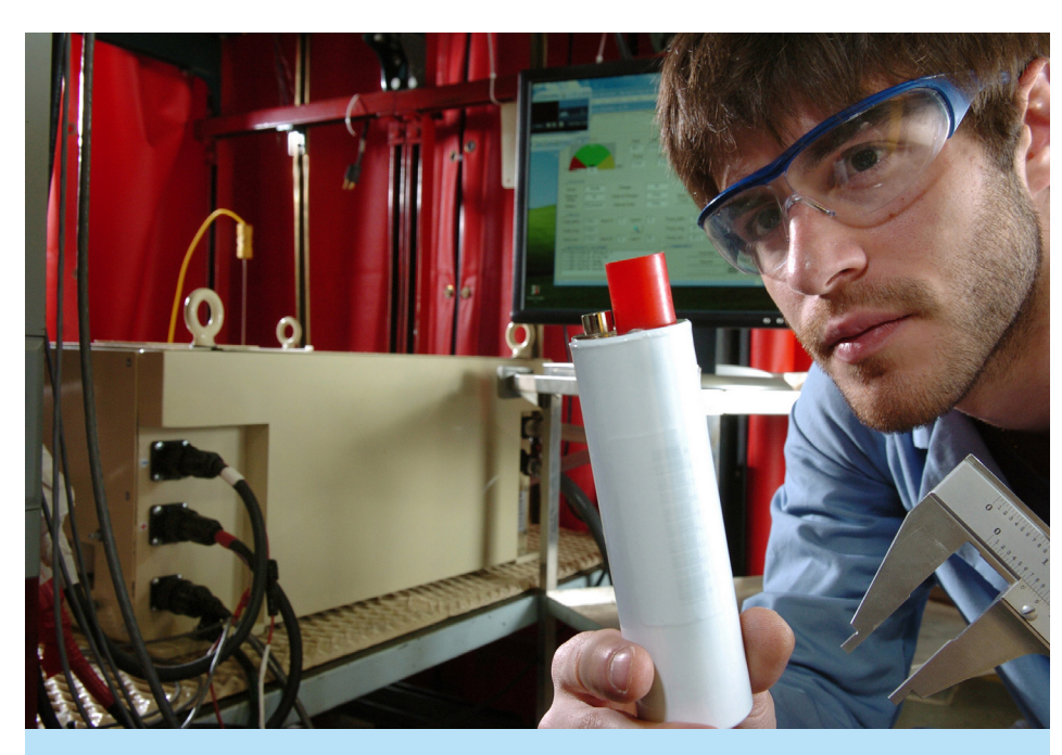
Examining a lithium-ion battery cell at the Battery Test Facility.

The current organization of Argonne's Electrochemical Energy Storage Department includes a battery test group and three battery R&D groups. The battery test laboratory changed its name to the Electrochemical Analysis and Diagnostic Laboratory (EADL), but it continues to provide DOE's transportation program and US auto companies with the same type of independent evaluations, using standardized test protocols that EADL helped to develop for DOE.