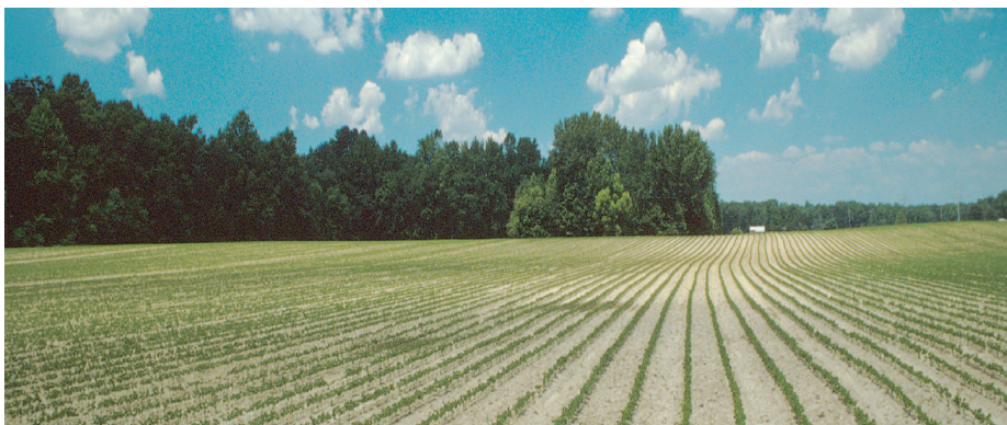
Soybean field on well-drained farmland on the Delmarva Peninsula.