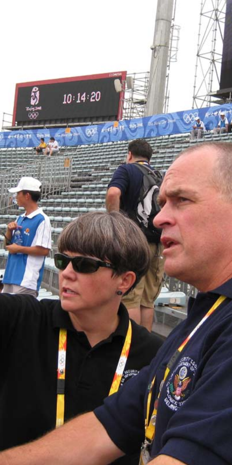
Regional Security Officers provide support to U.S. athletes, officials, sponsors, and citizens during major international events. Here two RSOs review security arrangements for American VIPs at the Wukesong baseball venue during the 2008 Olympic Games in Beijing.