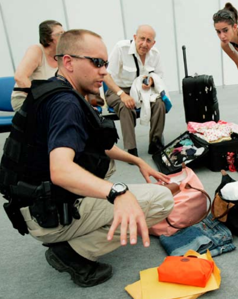
A Regional Security Officer, left, assists American citizens during the 2006 evacuation of Beirut.