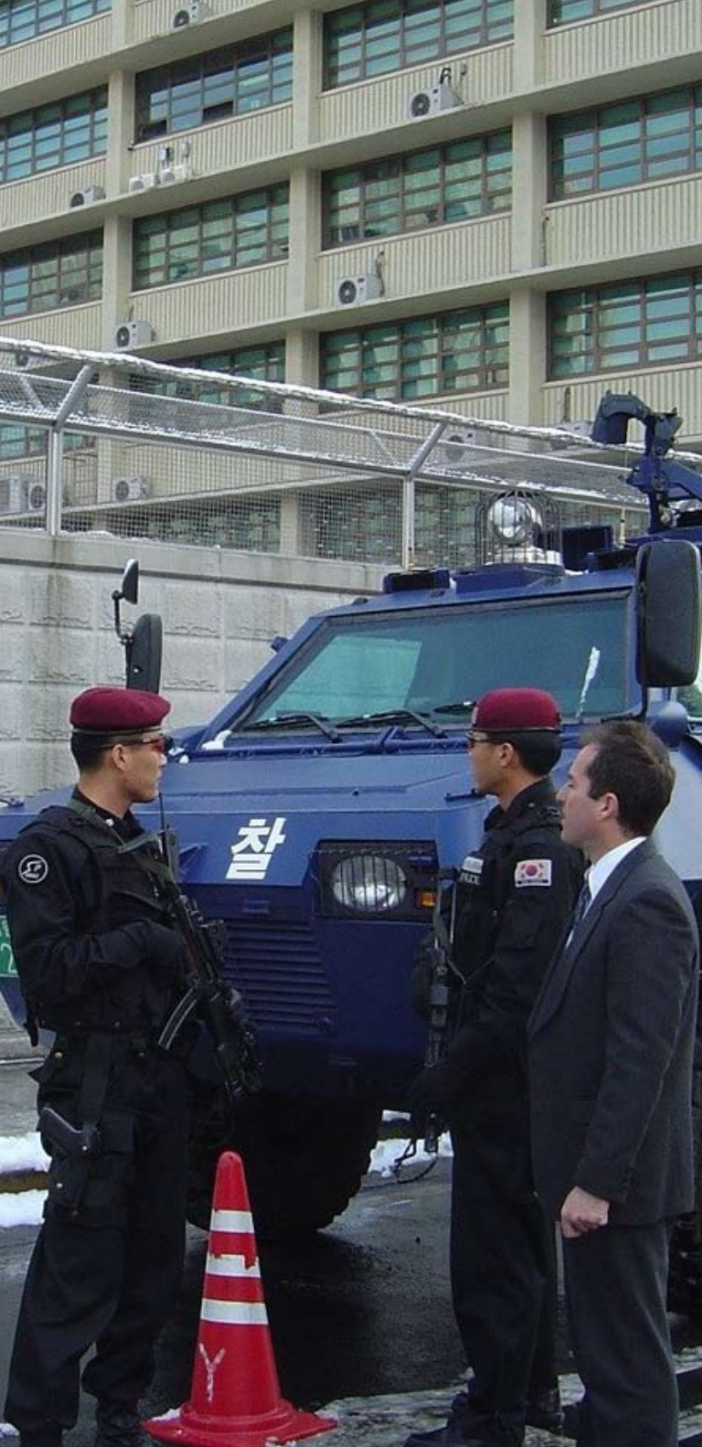
In Seoul, South Korea, a Regional Security Officer (right) coordinates with local SWAT team personnel.