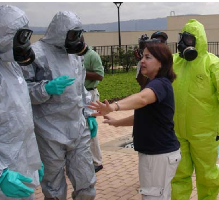
A Regional Security Officer briefs the U.S. Embassy WMD First Responder Team during a training exercise in Kigali, Rwanda.

If an emergency requires the evacuation of Americans, the RSO assists in disseminating information on evacuation times and locations. RSO personnel may also coordinate with host nation law enforcement and security agencies to ensure safe passage of Americans to evacuation points, and to provide and coordinate security at the points of departure.