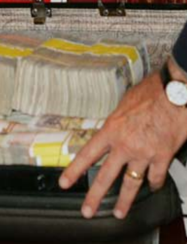
In Manila, a Regional Security Officer reveals suitcases of reward money for two informants who provided information that led to the capture of a leader of a terrorist organization.