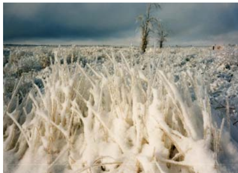
A peek of things to come. Are you ready?

Email: Robert.Bonner@noaa.gov Phone: 244-0110 x 225