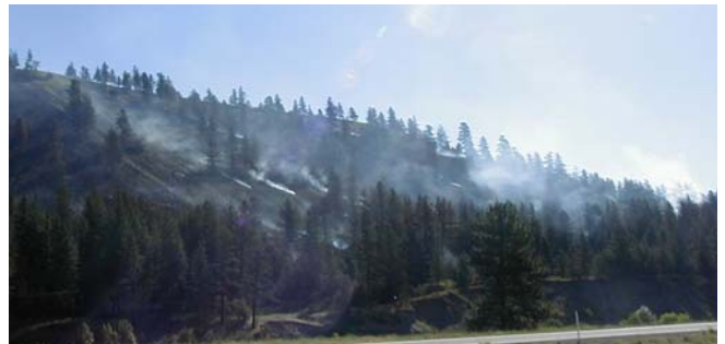
The side of South Hill in Spokane on 6/27/03

Concerns for a busy 2003 fire season in the Inland Northwest were justified with below normal mountain snow pack and a warm and dry late spring. With the season now winding down, hindsight shows a number of serious fires did occur, but the number of acres burned did not approach the large numbers recorded in 1994 and 2001. The weather played a critical role in limiting lightning related starts with a strong ridge in place for much of the summer. Any thunderstorms that did cause fires seemed confined to the US-Canada border areas from the North Cascades to the Okanogan and North Idaho. The Inland Northwest did experience one or two smoke episodes, primarily from fires in northwest Montana and southern British Columbia. ☼ John Livingston