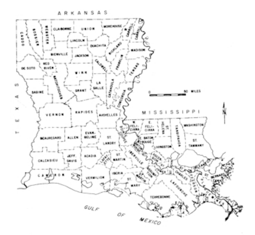
Figure 1. Location of parishes

survey is conducted by the U. S. Geological Survey in cooperation with the Louisiana Department of Public Works. Louisiana pumpage for 1960 and 1965 has been published in State reports (Snider and Forbes, 1961; Bieber and Forbes, 1966).