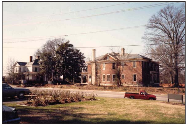
Turned 180 degrees, the moved building (B2) faces the historic one from a distance of 60 feet.