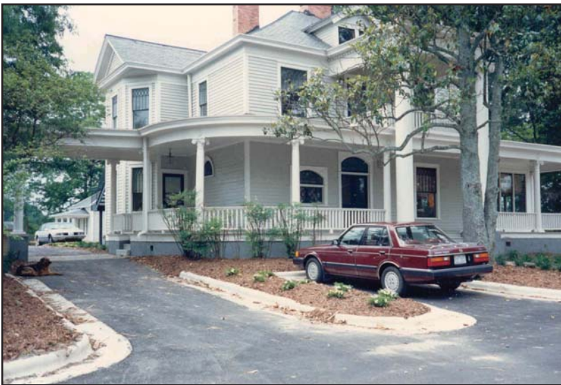
The new parking lot completes the drastic alteration of the setting. The second relocated structure (C2) can be seen through the porte-cochere at left.