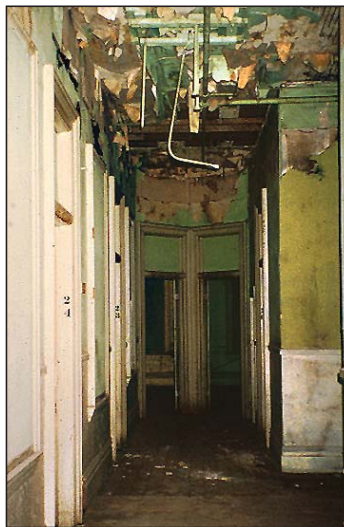
Left: Before the rehabilitation, the historic office building was in poor condition and many of the historic transoms had been sealed. (Before and after views are of different areas).

Application 1 (Compatible treatments): A circa 1890's four-story office building was converted into a rental office with first floor commercial space. At the time of rehabilitation, the owner did not have tenants for the upper floors. It was critical to determine if there would be multiple tenants or if each floor could be rented to a single tenant. If multiple tenants were to share a floor, there would have to be a fire separation between tenants and the exit corridor. Because a single tenant leased the building, the open transoms could be restored and made operable. This helped in providing natural cross ventilation on mild days when mechanical cooling was not necessary. It also meant that the doors did not have to be laminated on one side and the historic character of the building was fully preserved.