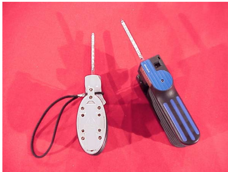
Figure 11-3. Detector Tube and Bellows-Type Pump Systems