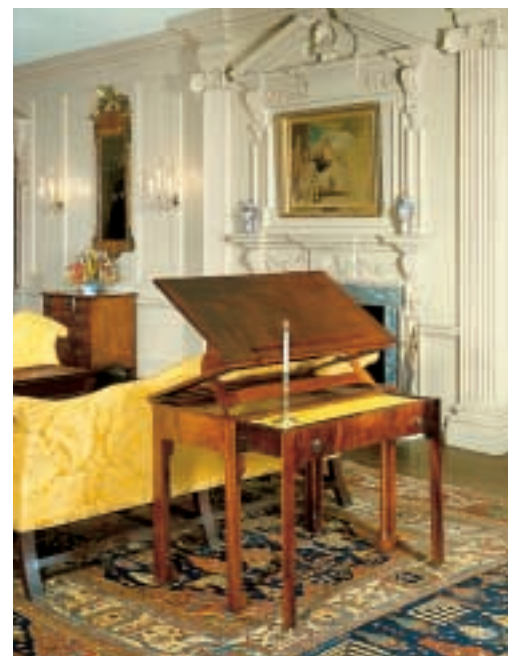
Philadelphia mahogany table-desk on which Thomas Jefferson drafted the Declaration of Independence.

Under the management of the Curator's Office, the Diplomatic Reception Room collection is made up of museum-caliber American furnishings of the period 1750 to 1825. These items are used to decorate the Diplomatic Reception Rooms located on the 8th floor of the Department of State, and 19 offices on the 7th floor used by the Secretary of State and the Secretary's senior staff. These items have been acquired through donations, or purchases funded through gifts from private citizens, foundations, and corporations. No tax dollars have been used to acquire or maintain the collection.