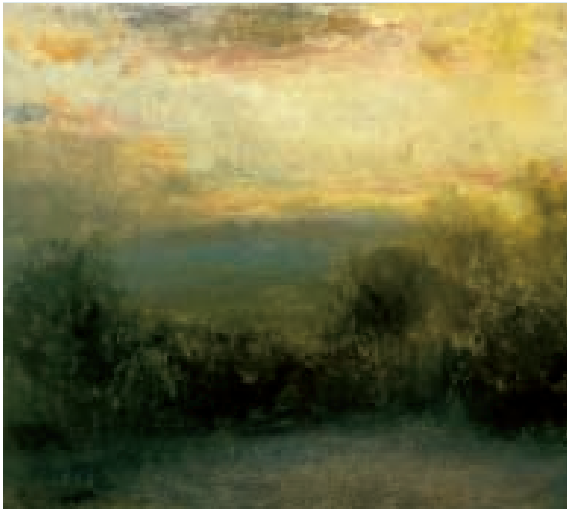
Suzanne Wiggin Winter Sky Oil-based Monotype 2000