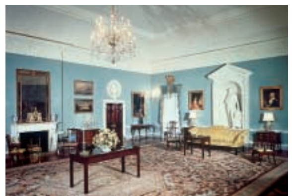
Thomas Jefferson State Reception Room.