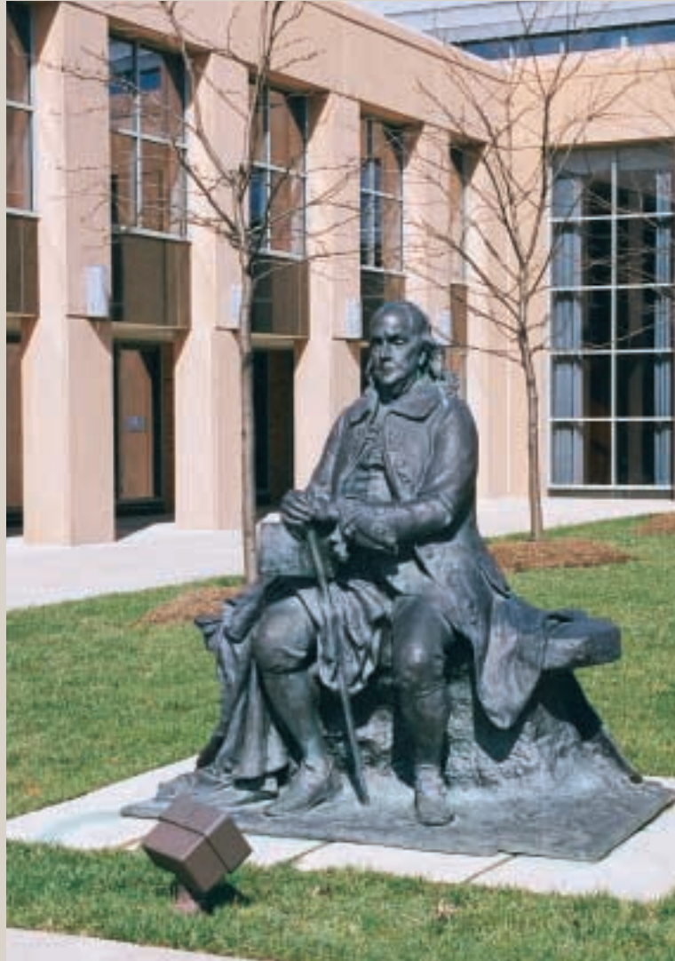
Houdon sculpture of Benjamin Franklin at the National Foreign Affairs Training Center.