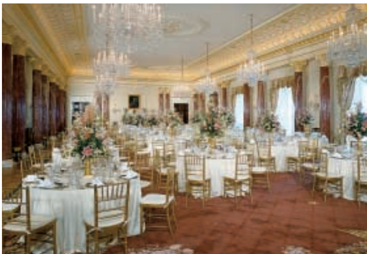
The Benjamin Franklin State Dining Room.