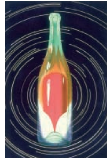
James Rosenquist While the Earth Revolves at Night Etching/Spit-bite aquatint 1982

The Art Bank was established in 1984 as a way to acquire artworks to display throughout the Department's offices and annexes. The artworks are displayed in staff offices, reception areas, conference rooms, the cafeteria, and related public areas. The collection consists of original works on paper (watercolors and pastels) and limited edition prints (lithographs, woodcuts, intaglios, and silk-screens). These items are acquired through purchases funded by contributions from each participating bureau.