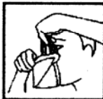
Position mask under chin with nose clip facing up