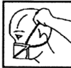
Pull one strap over head and position it