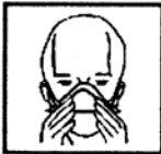
Mold nose clip to shape of nose