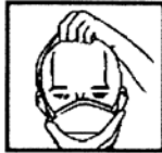
Pull straps over head and rest on neck