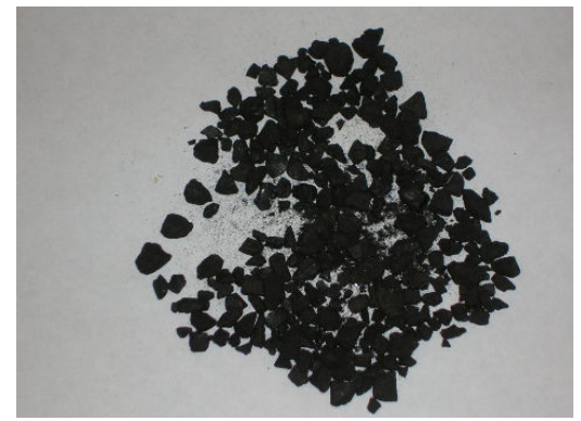
Carbo*Prill (w/o ammonium nitrate or oil)