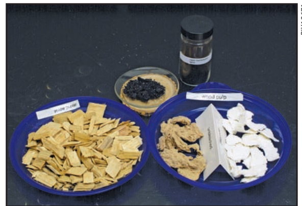
The clean fractionation process can be used for many biomass feedstocks.