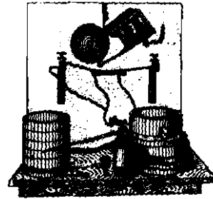
Popov's Lightning Detector (1894)