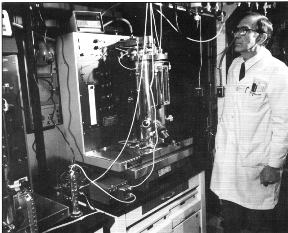
The new process integration laboratories will use equipment like this posttreatment vessel that can be sterilized in place, saving considerable turnaround time between different process operations.

Integrating these steps together will allow the NREL team to answer many questions crucial for designing a successful commercial operation. Which pretreatment processes are most effective on which types of biomass feedstocks? What process variables (temperature, time, and pH) will maximize yields? What effect will chemical or biological by-products from one step have on subsequent steps and on the overall process? Process integration will be particularly valuable in assessing and improving the ability of the planned system to recycle water and other components. Being able to recycle water and nutrients will greatly improve the economics of the process itself and save on wastewater treatment costs. It may also be possible to reuse some of the microorganisms, nutrients, or enzymes.