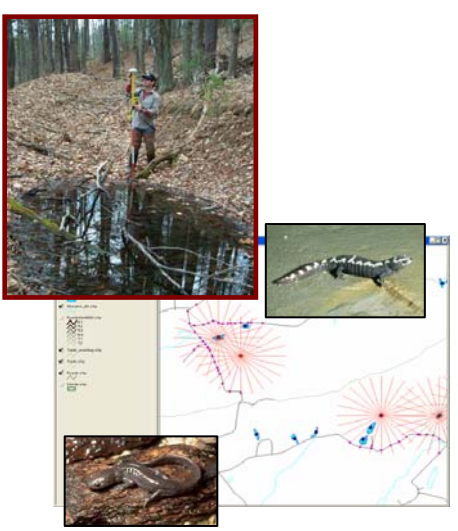
Biological surveys, field mapping, and spatial analysis of pond habitats in Delaware Water Gap NRA are being used to determine population status, breeding habitat usage, and potential threats to pond breeding amphibians from near park development. (PI: Snyder, Young)

LSC seeks to expand our partnerships within the USGS and DOI, and to develop and apply landscape ecology approaches to the benefit of all our research partners.