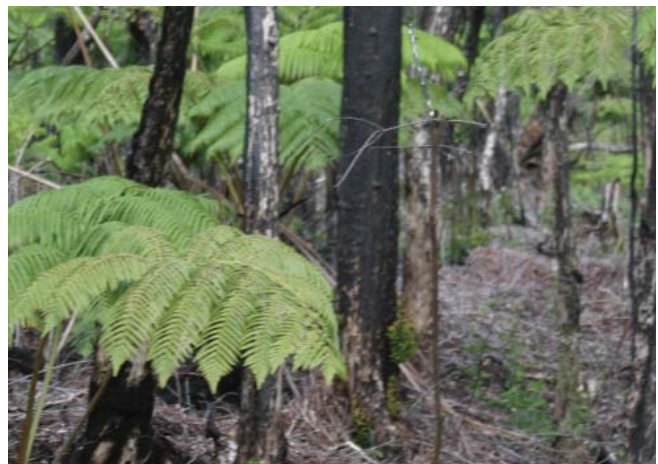
Hapu'u, Hawaiian tree fern ( Cibotium glaucum ) survival after fire in the understory of higher elevation rain forest.

At higher, wetter elevations, shrubland gives way to tree dominated communities. At 1,204 to 2,100 feet (550 to 640 meters), ohia trees dominate the canopy with sword fern predominant in the understory. At 1,200 to 2,460 feet (640 to 750 meters), the understory consists of uluhe ( Dicranopteris linearis ), a native fern that forms a dense mat on the forest floor. At the highest elevation, from 2,297 to 2,789 feet (700 to 850 meters), the understory is dominated by the native Hawaiian tree fern, hapu'u pulu ( Cibotium glaucum ).