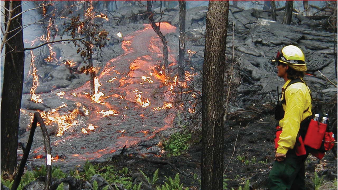
A firefighter stands by as molten lava seeps through the forest.