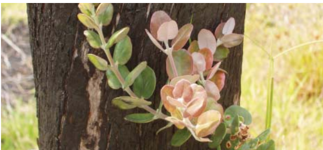
Despite topkill of the canopy, nearly half of the ohī'a lehua ( Metrosideros polymorpha ) trees sprouted from the base following fire across the study area.

A second study followed changes in composition of vegetation for two years after lava-ignited fires across an elevation and plant community gradient from the lower elevation seasonally dry shrubland to higher elevation rainforest.