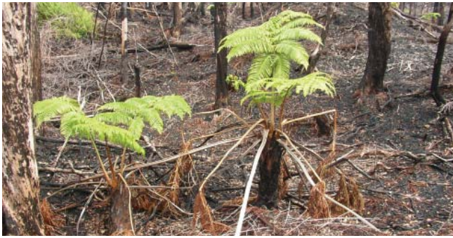
Native Hap'u, Hawaiian tree fern ( Cibotium glaucum ) survival after fire in the understory of higher elevation rain forest.