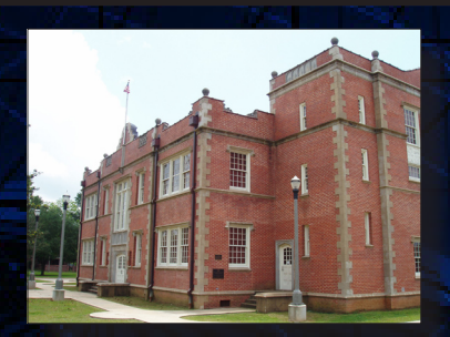
Lee H. Nelson Hall Home of NCPTT

National Center for Preservation Technology & Training • Technology Serving the Future of America's Heritage