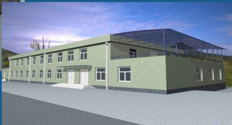
Quality Control Lab