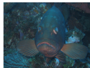
Red grouper observed in the Reserve during the August cruise.

Marine Protected Area Successful in Conserving Fishery Resources. Scientists from the National Centers for Coastal Ocean Science (NCCOS) recently determined that the Tortugas Ecological Reserve in the Florida Keys can effectively protect coral reef ecosystems. Data from an August 2008 NCCOS cruise aboard the NOAA Ship Nancy Foster provided evidence of an increased grouper population and reduced marine debris within the Reserve. Specifically, fish surveys indicated that grouper numbers within the Reserve were 2.4 times higher, and that nine grouper species were found inside the Reserve as compared to only five species found outside the Reserve. Durable derelict fishing gear made up 90% of all marine debris observed, and amounts were similar inside and outside the Reserve. In contrast, non-fishing debris was observed at only 4% of sites inside but at 32% of sites outside the Reserve. Further data processing is ongoing and results will be provided to reef resource managers in the region.