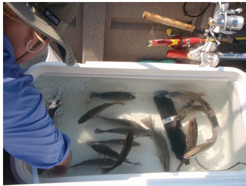
Testing acoustic tag signals for tagged juvenile mangrove snappers earlier in this project.

Race to the Reef: Juvenile Snapper Acoustic Tagging and Tracking. The CRCP's Juvenile Snapper Acoustic Tracking Project completed its last big data retrieval in mid-August. Juvenile mangrove snappers were tagged at two estuarine habitats in May 2008. This latest data retrieval has revealed the following trends: juvenile mangrove snappers tend to move downstream towards the more marine environment, correlated with anthropogenic freshwater input