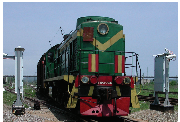
Radiation-monitoring systems in Russia and key borders

Emerging national security challenges also require the Laboratory to advance its scientific user-facility infrastructure and to attract and retain the best talent. Currently in development is a set of facilities called MaRIE, or Material-Radiation Interaction in Extremes. The purpose of MaRIE is to provide tools that would allow the Laboratory to address the critical materials-related scientific questions relevant to a broad spectrum of current and future missions.