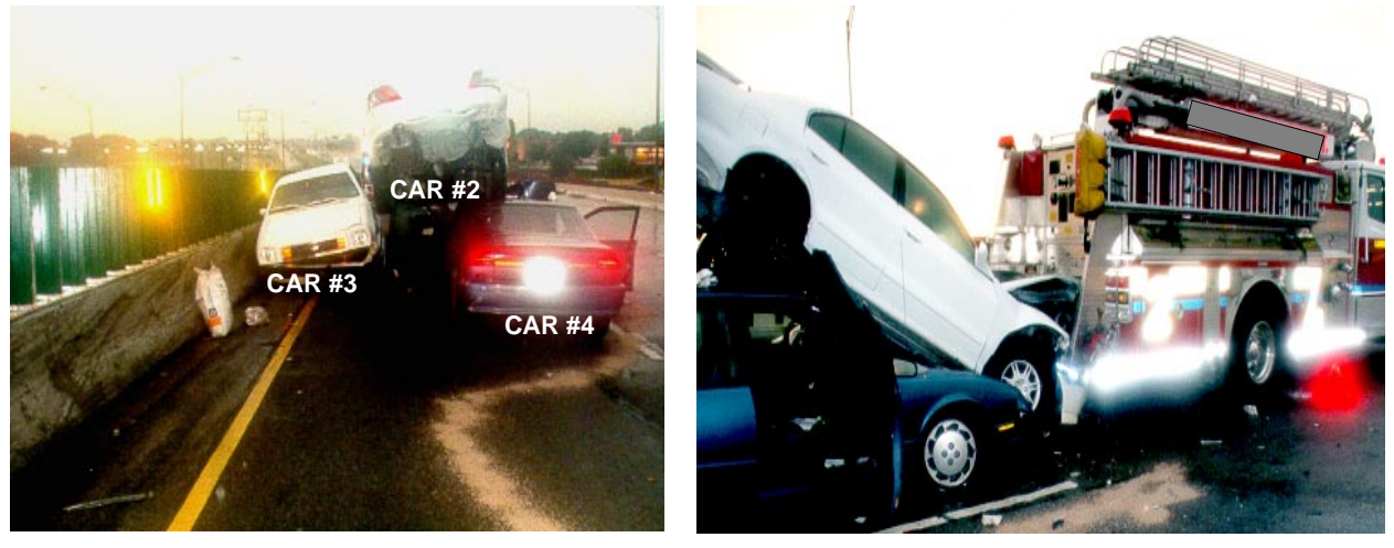
View from back of scene