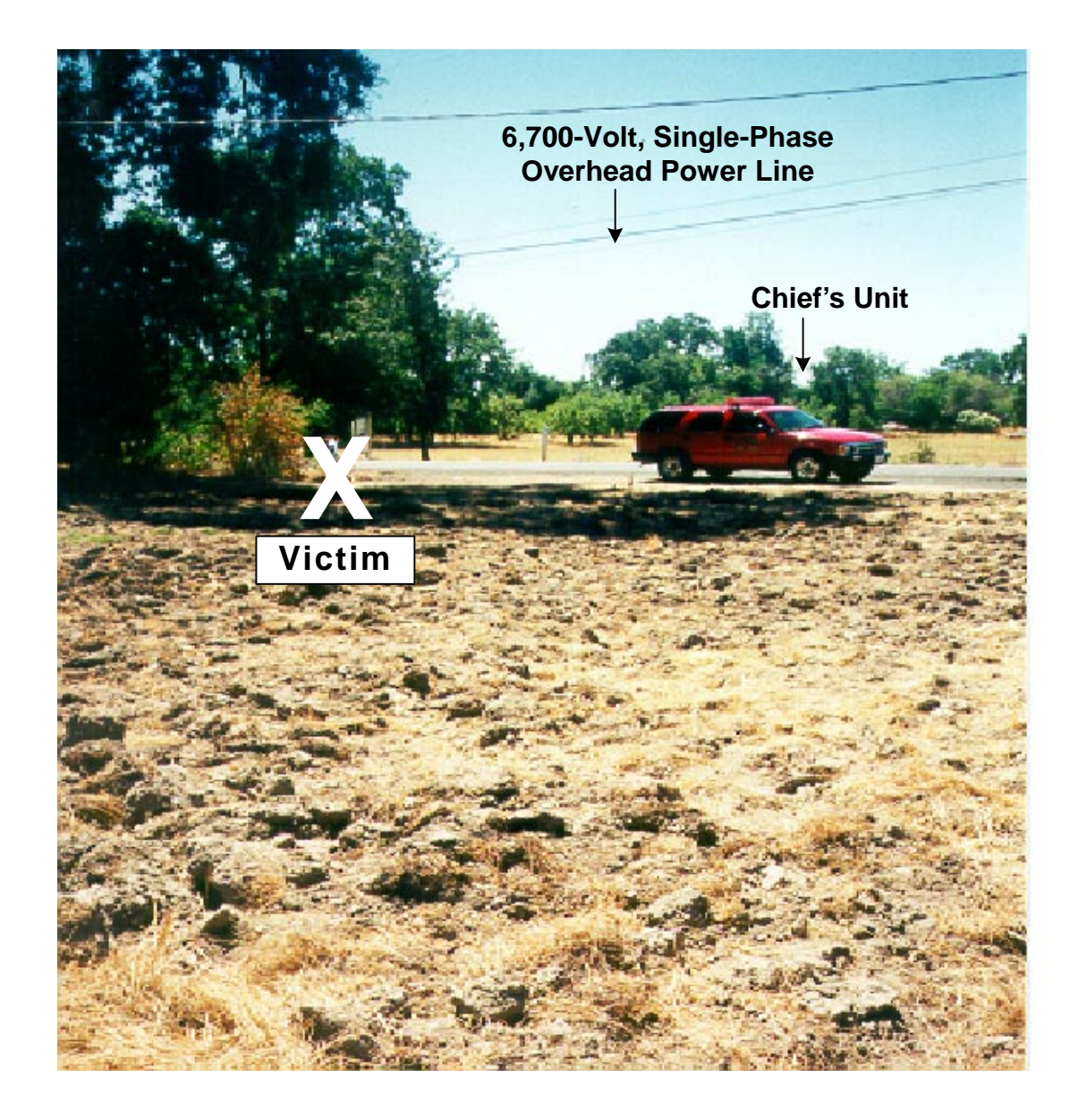
Figure 1. Photo of Incident Site