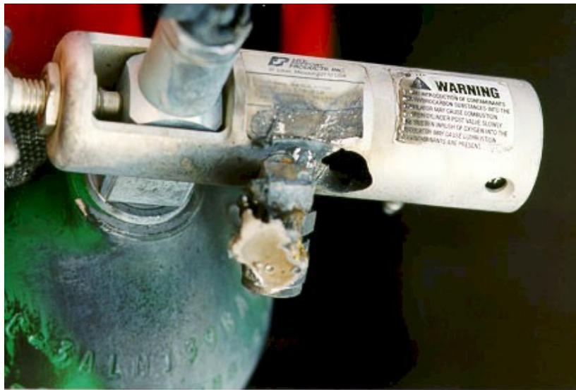
Photo 6: This photo depicts the warning label that is placed on the retrofitted regulator. The sticker serves as a warning as well as an identifier that the regulator has been retrofitted.