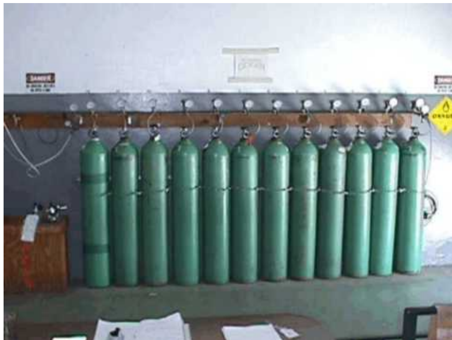
Photo 4: This photo depicts the cascade system used by the fire department to refill the oxygen cylinders. The cascade system is composed of 12 M-size (300 cubic