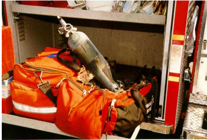
Photo 1: This photo depicts the airway bag which contained an aluminum cylinder filled with 99.7% pure oxygen, an aluminum regulator attached to the cylinder, and airway supplies.