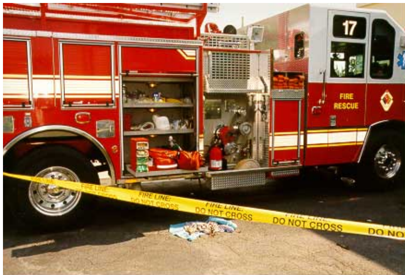
Photo 2: This photo depicts the incident scene where the victim was severely burned.