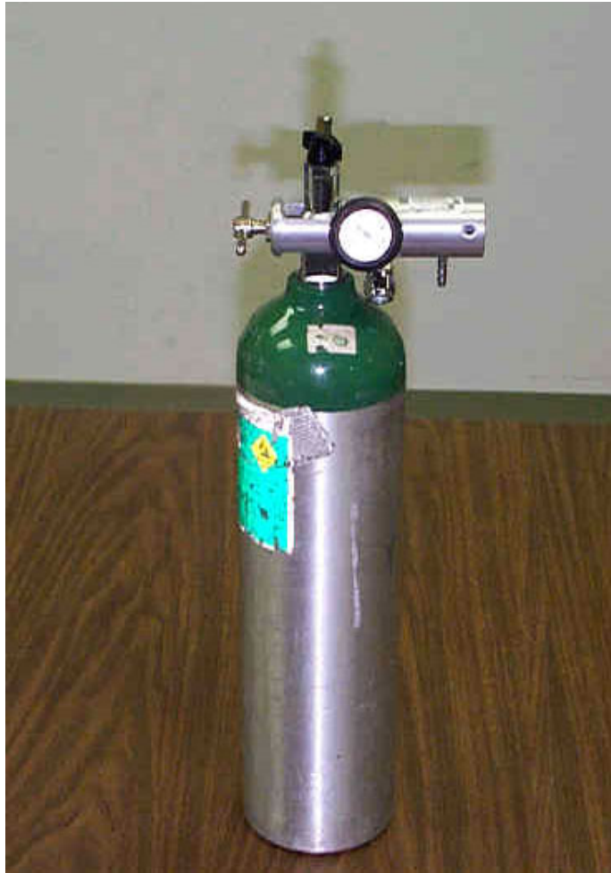
Photo 3: This photo depicts a D-size cylinder similar to the one that was involved in the incident.