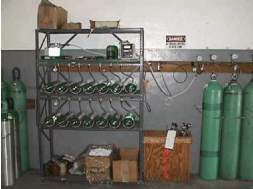
Photo 5: This photo depicts the cascade system at station 34 which is capable of refilling 14 D-size oxygen cylinders at a time. Two banks of 14 cylinders (27 total) are arranged in a storage rack for filling.