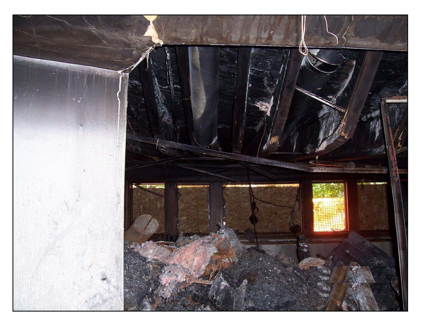
Photo 5. Windows on C-Side of structure where fire fighter exited basement.

Career Engineer Dies and Fire Fighter Injured After Falling Through Floor While Conducting a Primary Search at a Residential Structure Fire– Wisconsin