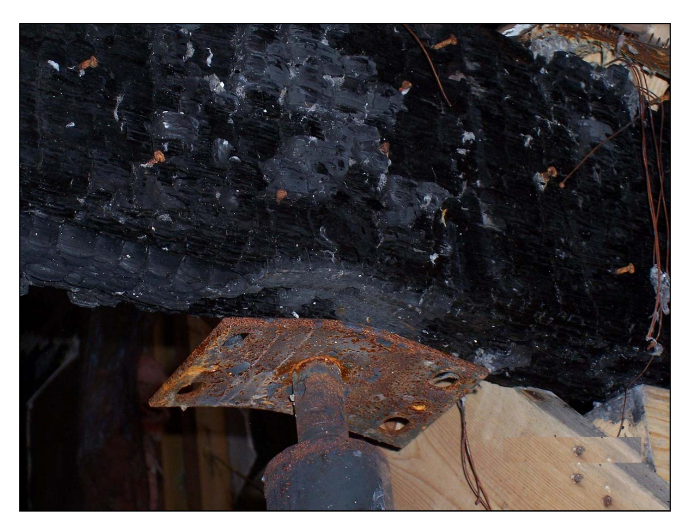
Photo2. Wooden beam and metal post jack

Career Engineer Dies and Fire Fighter Injured After Falling Through Floor While Conducting a Primary Search at a Residential Structure Fire– Wisconsin