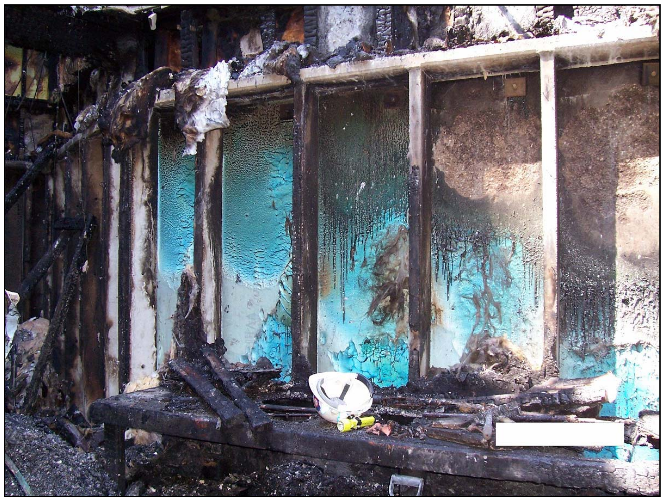
Photo1. Framed pre-cast walls with sheets of foam insulation

Career Engineer Dies and Fire Fighter Injured After Falling Through Floor While Conducting a Primary Search at a Residential Structure Fire–Wisconsin