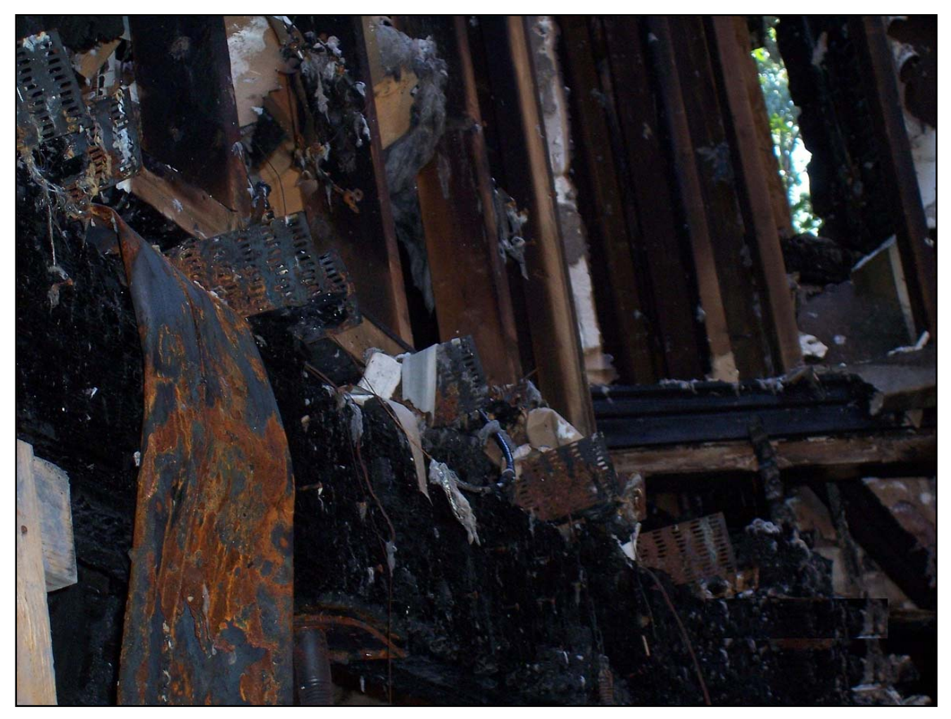
Photo 3. Wooden beam and metal post jacks with bottom gusset plates from floor joists pinned to beam by first floor framing after entire floor joist consumed by fire.

Career Engineer Dies and Fire Fighter Injured After Falling Through Floor While Conducting a Primary Search at a Residential Structure Fire– Wisconsin