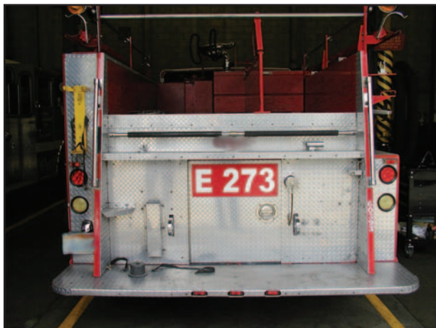
Tailboard of Engine 273

On August 14, 2004, a 25-year-old female career fire fighter (the victim) died when she apparently fell from the tailboard and was backed over by her engine. On August 16, 2004, the U.S. Fire Administration (USFA) notified the National Institute for Occupational Safety and Health (NIOSH) of the fatality. On January 5 through January 7, 2005, a Safety and Occupational Health Specialist from the NIOSH Division of Safety Research investigated the incident. Meetings were conducted with officers of the fire department. Interviews were conducted with officers and fire fighters who were at the incident scene. The NIOSH investigator reviewed the department's standard operating procedures (SOPs), the fire department's incident report, the victim's training records, photographs, and drawings of the incident site. The incident site was also visited and photographed.