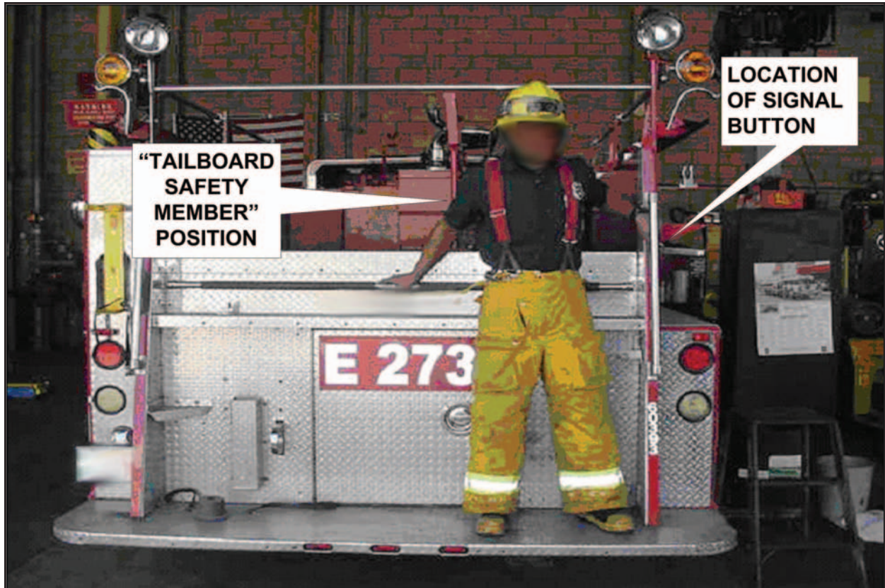
Photo 2. Demonstration of victim's position and function just prior to incident