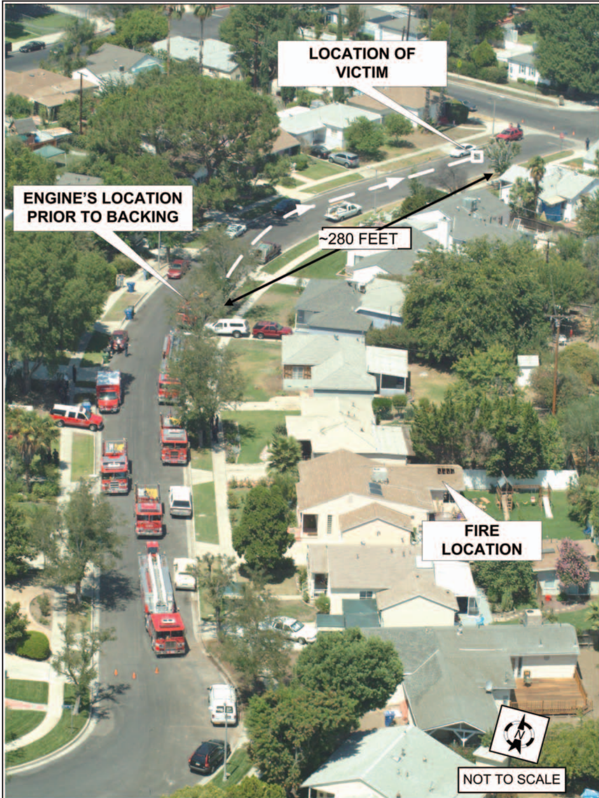
Photo 1. Recreated incident scene