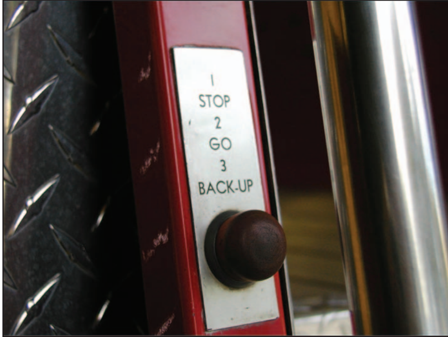
Photo 3. Push button on rear panel of engine with operating instructions