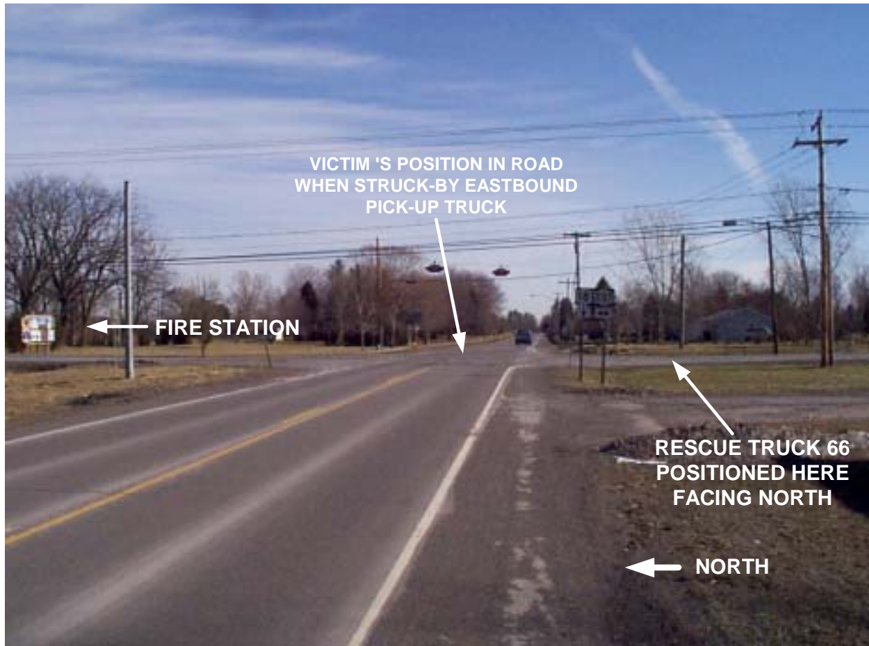
Photo. Eastbound View of Intersection