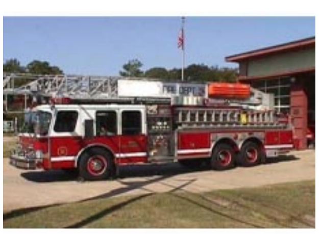
Ladder Truck Involved in Incident

career fire fighter (the victim) died after attempting approximately 1810 hours the truck exited the bay area of the station with lights and sirens activated. The truck moved down the station's driveway apron and paused briefly to wait for traffic heading westbound to yield for the truck. The truck outside the station when the driver, along with a crossed over the three westbound traffic lanes and made a left turn. Note: According to several civilian witnesses' statements, during this time the victim was running beside the driver's side to the truck. The fire fighter and the victim walked jump-seat door while trying to catch up to the towards the rear of the truck. The fire fighter told truck . The truck continued to travel in an inside turning lane, heading eastbound. The truck began to accelerate as it was straightening out from making the left turn. With the turning lane ending at an intersection, the driver looked in the rear view mirror on the Captain's side and made a right turn to merge into the center lane of traffic at the intersection. As the truck approached the intersection all three personnel on the truck felt a "thump." Upon checking both mirrors the driver saw the victim lying on the ground. The driver told the Captain that the victim had fallen out of