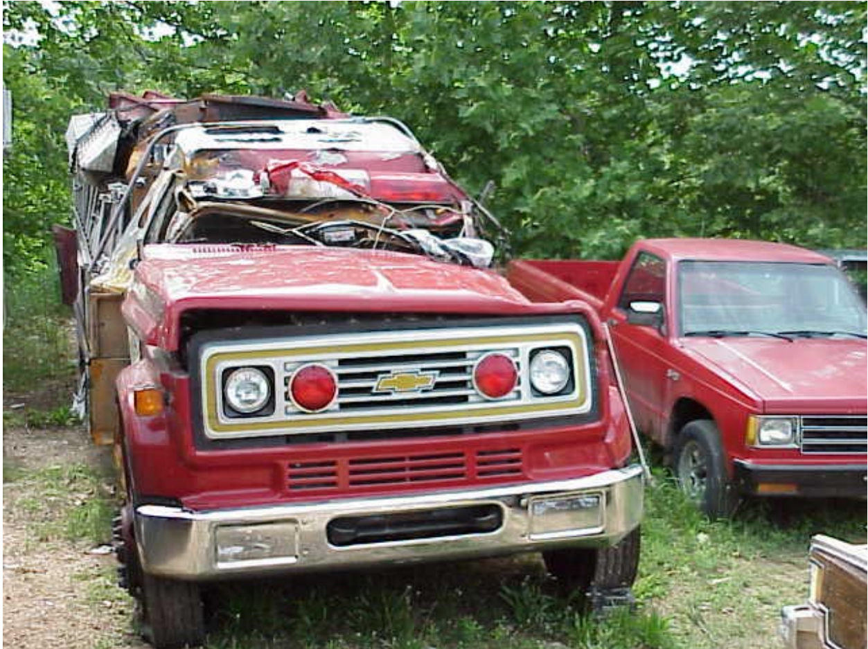
Photo 3. Pumper Truck Involved in This Incident