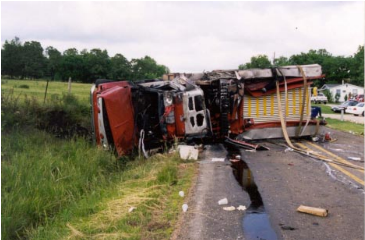
Photo 2. Incident Site