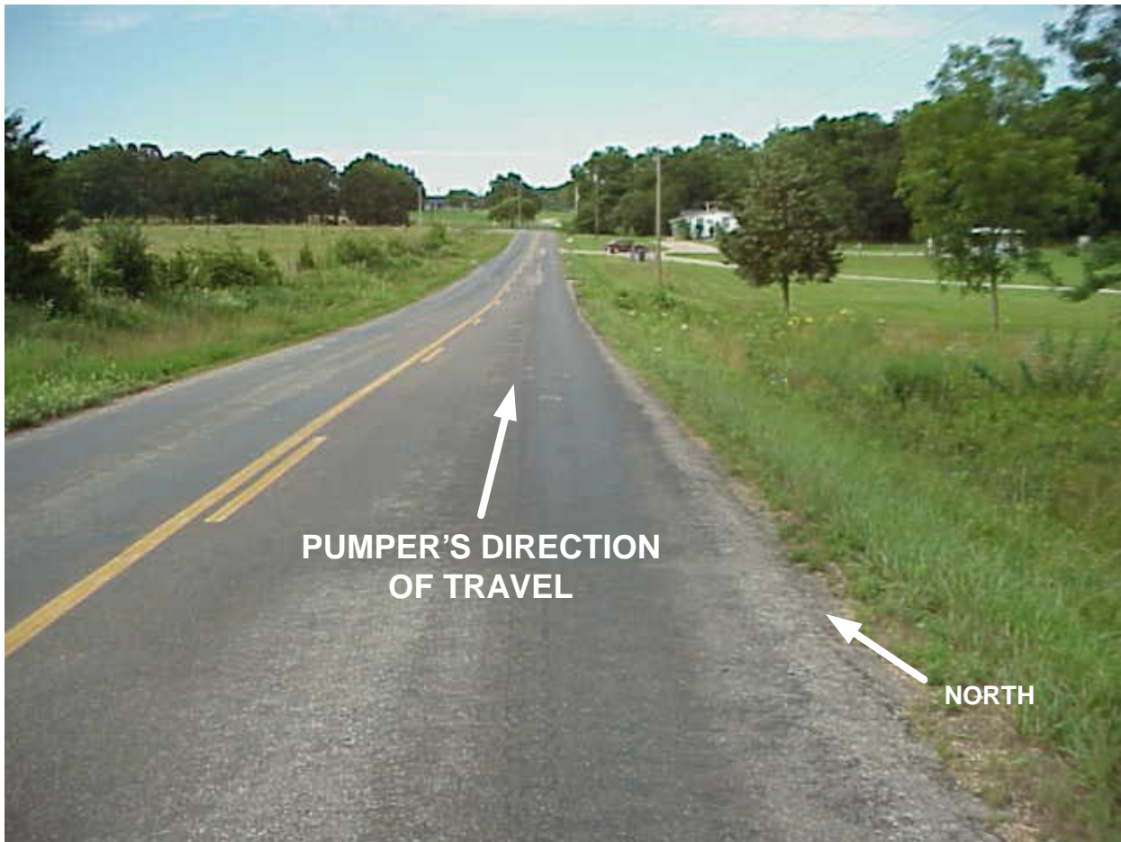
Photo 1. View of Road Traveling Northbound Where Pumper Truck Veered Off Road and Rolled Over