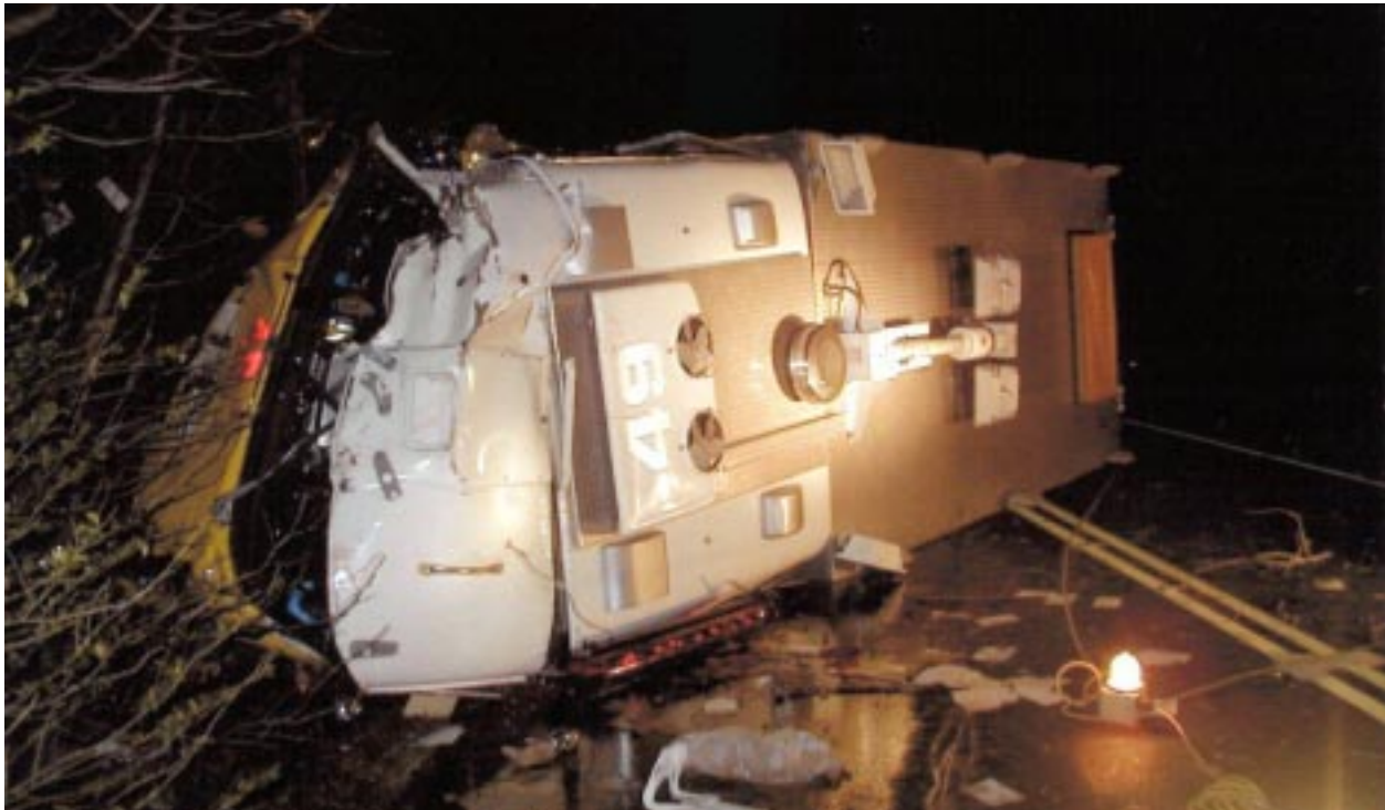
Photo 1. Rescue 1 After Impact With the Tree.