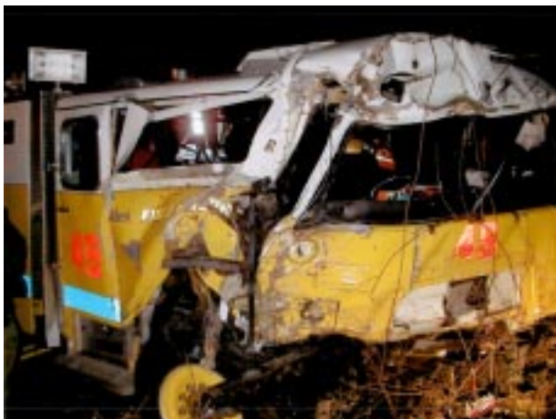
Rescue Truck Involved in This Incident

The Fire Fighter Fatality Investigation and Prevention Program is conducted by the National Institute for Occupational Safety and Health (NIOSH). The purpose of the program is to determine factors that cause or contribute to fire fighter deaths suffered in the line of duty. Identification of causal and contributing factors enable researchers and safety specialists to develop strategies for preventing future similar incidents. The program does not seek to place blame on fire departments or individual fire fighters. To request additional copies of this report (specify the case number shown in the shield above), other fatality investigation reports, or further information, visit the Program Website at www.cdc.gov/niosh/firehome.html or call toll free 1-800-35NIOSH