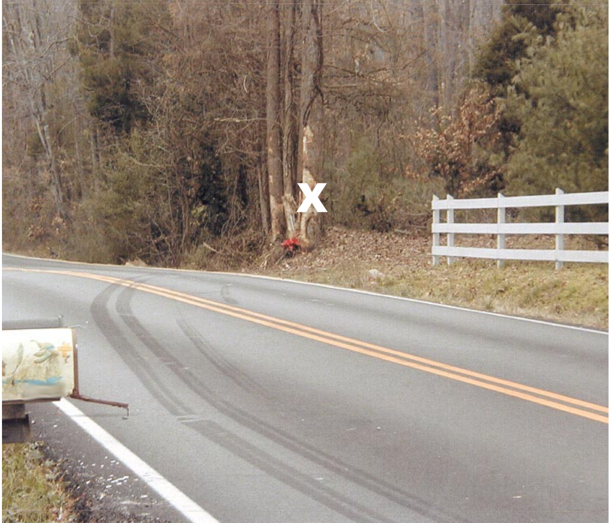
Photo 5. The X Indicates the Point of Impact of the Rescue Truck With the Tree.