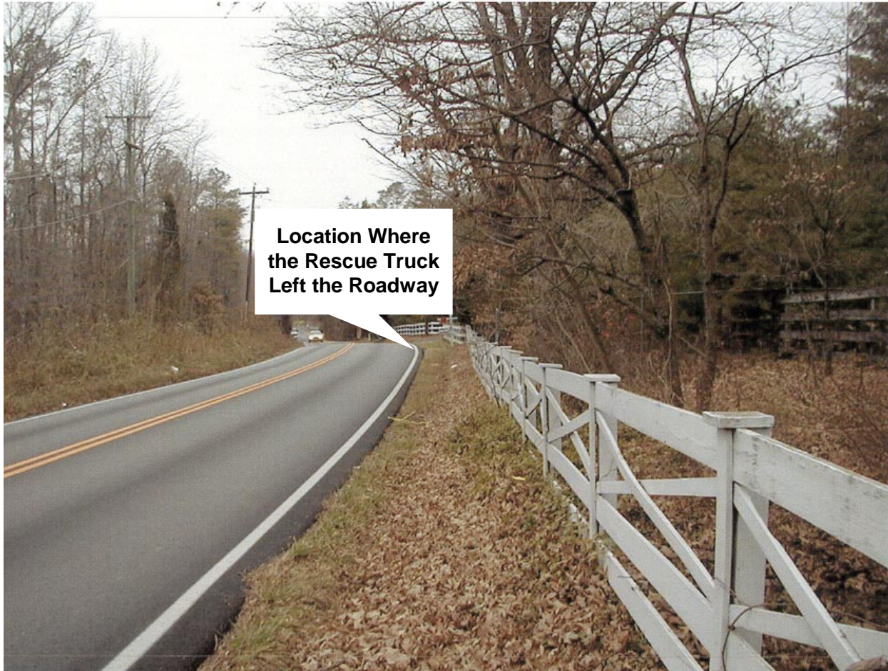
Photo 3. Incident Site.