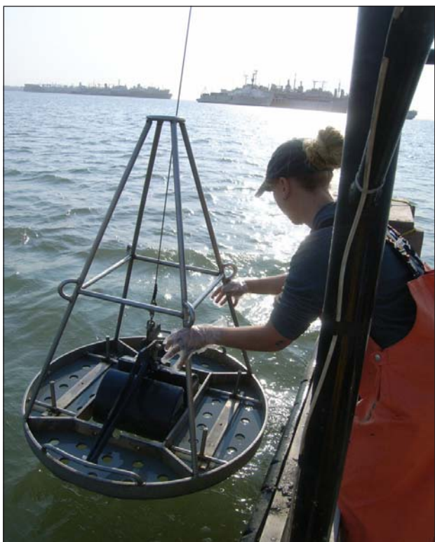
Photo, above left: A VanVeen sampler is used to collect surface sediment samples. The sediment in this grab sampler will be transferred to glass jars for shipping to the analytical laboratories.

NOAA's Damage Assessment, Remediation, and Restoration Program (DARRP) collaborates with other agencies, industry, and citizens to protect and restore coastal and marine resources threatened or injured by oil spills, releases of hazardous substances, and vessel groundings.