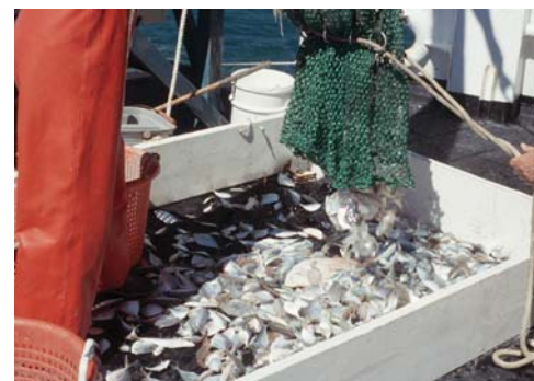
Fish caught during trawl operations are sorted, measured and recorded by NMFS scientists