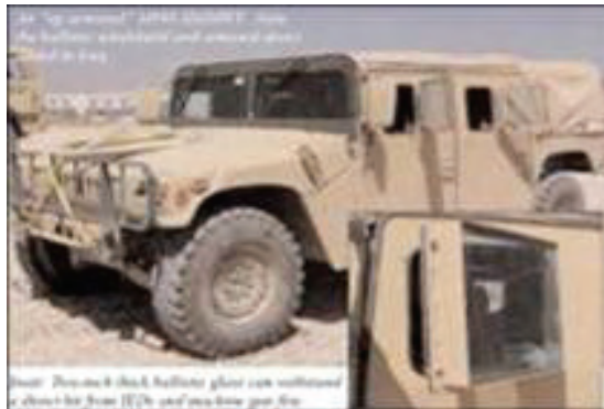
Figure 4. Armored HMMWV

*This contract also procured 102,698 armor kits; the value of the kits is included in the contract price column above. The Army may increase the quantity ordered on this contract through option year 2007 and, if exercised, 2008.