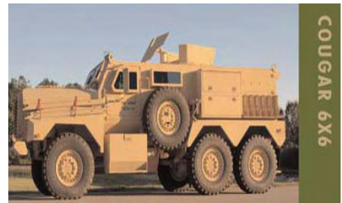
Figure 3. Cougar 6x6

JERRV. MCSC awarded three sole-source contracts to FPI for the JERRV. In May 2005, MCSC became the procuring service for the Cougar for all military services, and the Cougar became a joint service vehicle known as the JERRV. In May 2005, MCSC awarded a sole-source contract to FPI for 122 JERRVs. In May 2006, MCSC awarded a second sole-source contract to FPI for 79 JERRVs. In mid-November 2006, MCSC awarded a third sole-source contract to FPI for 200 JERRVs as part of the MRAP program. MCSC also procured 80 Buffalos under this contract. During our visit in late November 2006, a program official stated that MCSC planned to compete future contracts for the JERRV.