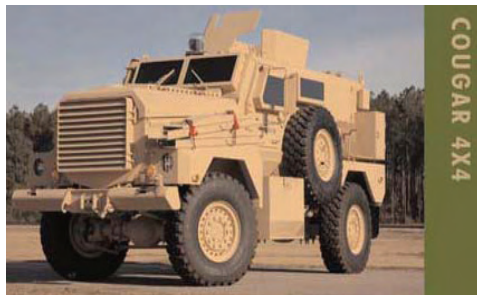
Figure 2. Cougar 4x4

Cougar. In April 2004, MCSC awarded a sole-source contract to FPI for 28 Cougars. The Cougar is a hardened engineering vehicle that provides protection against armor-piercing rounds and high-explosive projectiles. The Cougar is available in two configurations: a 4x4 design (see Figure 2) and 6x6 design (see Figure 3). Both designs are used for ordnance disposal, communications, command and control, and leading convoy missions. Similar to the Buffalo, the Cougar has an armored v-shaped hull that deflects outward the blast from an improvised explosive device, increasing the chance of survival for those inside the vehicle.