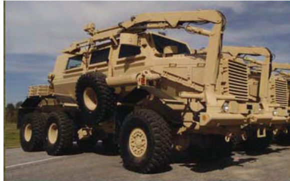
Figure 1. Buffalo

TACOM LCMC and MCSC contracting practices followed for procuring the Buffalo.