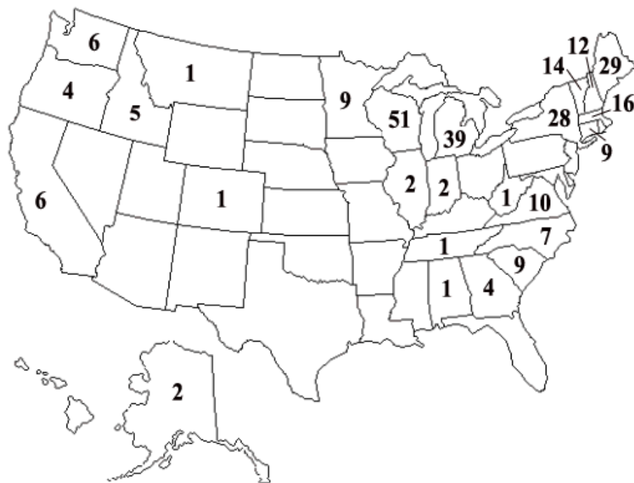
Figure 2-1. Geographical distribution of 269 projects (=licenses) with at least one license article that addressed fish passage.

Of the 269 projects, 231 (86%) had a license article reserving the FERC's authority under Section 18 of the FPA to require construction, operation, and maintenance of fishways as may be prescribed by the U.S. Department of the Interior (Fish and Wildlife Service or FWS) or the U.S. Department of Commerce (National Oceanic and Atmospheric Administration or NOAA Fisheries). Although fish passage may not be required by FWS or NOAA Fisheries at the time of project licensing, the agencies may recommend that reservation of authority be included in the license.