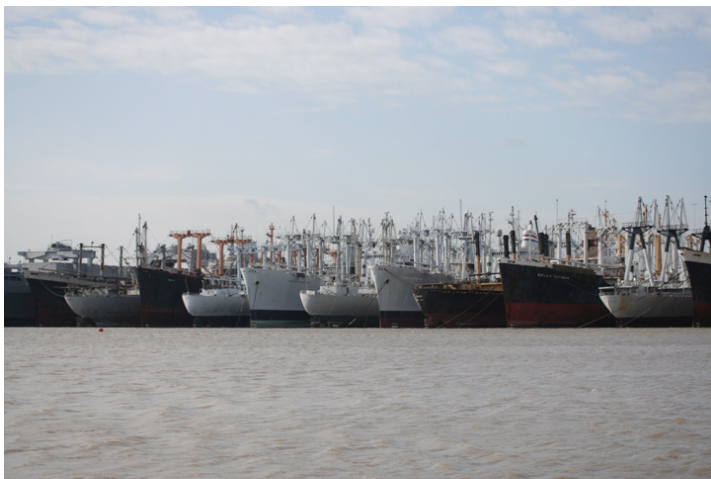
Photo of the Suisun Bay Reserve Fleet taken in summer of 2008.

Depending on the length of review needed NOAA intends to release the final report at the end of February. The document and data will be posted to NOAA's website for public distribution.