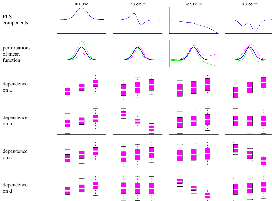
Figure 4. Dependence of the coefficients of PLS expansion on the parameters

Curve registration may be needed or advisable when the parameters affect the time- or space-scale or when the functions are not sampled at identical times in different runs. We would likely be interested in studying the sensitivity of the scaling and shifting to the input parameters, independently of the variability in the functional outputs after adjusting for these effects. Again, Ramsay and Silverman [2] address this problem in detail, proposing a series of methods from parametric location and/or scale change, through feature or landmark registration methods, to the estimation of general monotonic transformation.