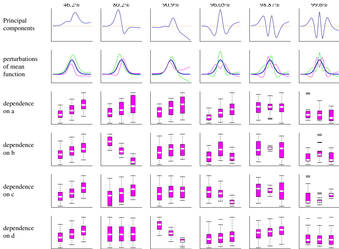
Figure 3. Dependence of the coefficients of PCA expansion on the parameters

These first three terms capture over 90% of the total variance, compared to seven terms required by the Legendre analysis. The fourth component, which accounts for another 5% of the total variance, is a symmetric kurtosis or tail-fattening component depending most strongly on a and c .