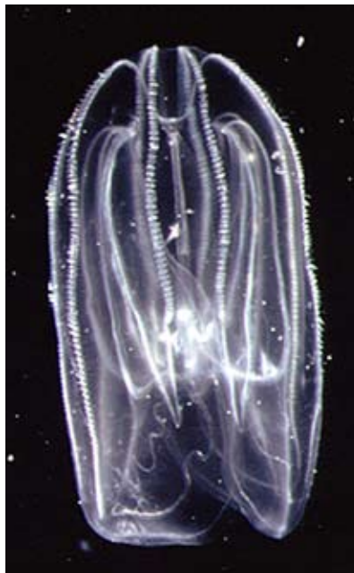
Comb jelly.

◆ A large cargo ship can move and discharge millions of gallons of ballast water and the organisms it contains. The ballast tanks of cargo ships have been identified as the largest single contributor to the global movement of aquatic species.