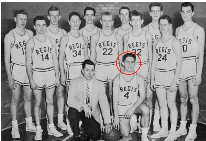
Figure 2 Anthony S. Fauci (circled) as captain of the Regis High School basketball team circa 1958.

sion, qualities he is known for today and instills in the people who work with him.