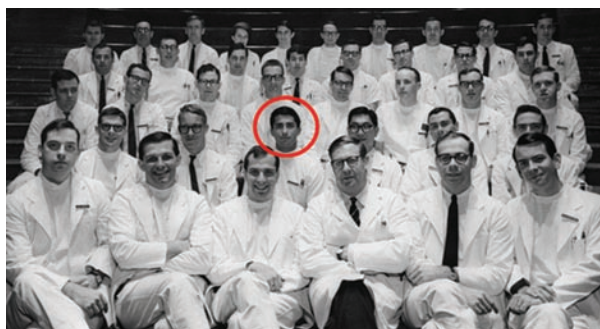
Figure 3 The New York Hospital house staff, 1966–1967 (Fauci circled).

That small lab was where Tony's career as a clinical investigator really flourished. He rapidly assembled a strong team focusing on immune regulation. His early studies included demonstrating the therapeutic effect of cyclophosphamide on Wegener's granulomatosis and other vasculitides (4, 5). In 1980, Tony Fauci was made Chief of the new Laboratory of Immunoregulation. A 1985 Stanford University Arthritis Center Survey of the American Rheumatism Association ranked Dr. Fauci's work on