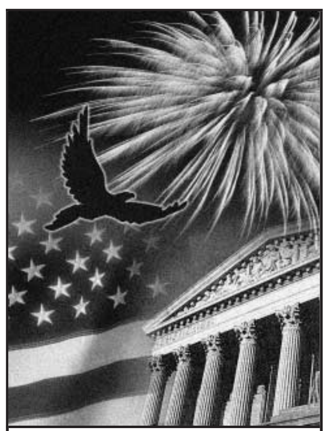
Get forms and other information faster and easier by: