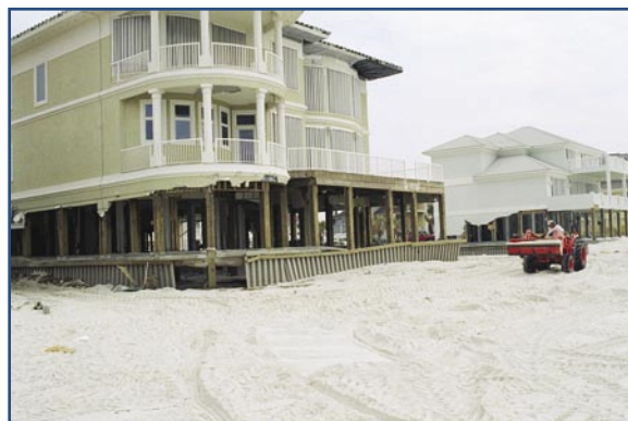
Breakaway walls that failed under the flood forces of Hurricane Ivan.

This Home Builder's Guide to Coastal Construction recommends the use of insect screening or open wood lattice instead of solid enclosures beneath elevated residential buildings.