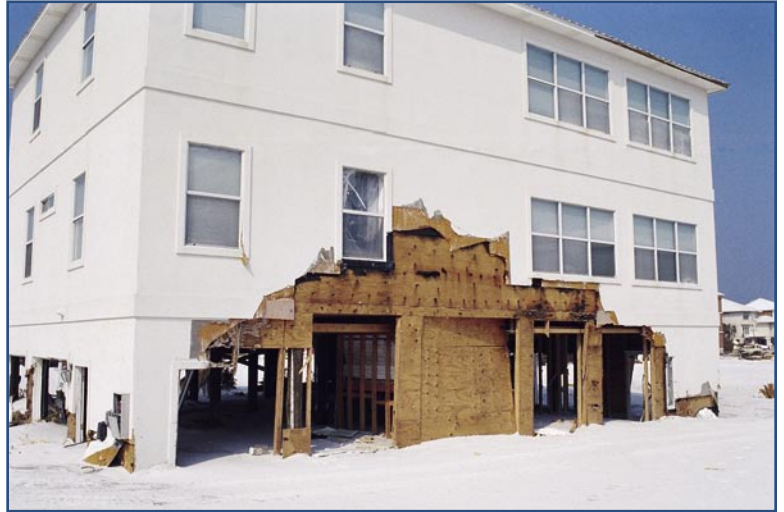
Siding on the non-breakaway portions of this elevated building was extended over breakaway enclosure walls and was damaged when breakaway walls failed under flood forces.