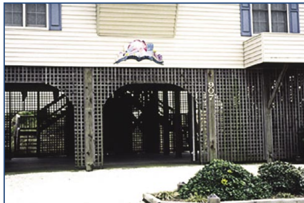
Open wood lattice installed beneath an elevated house in a V zone.