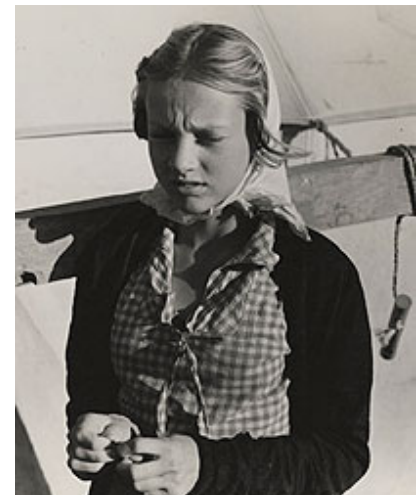
A young FSA camp resident.